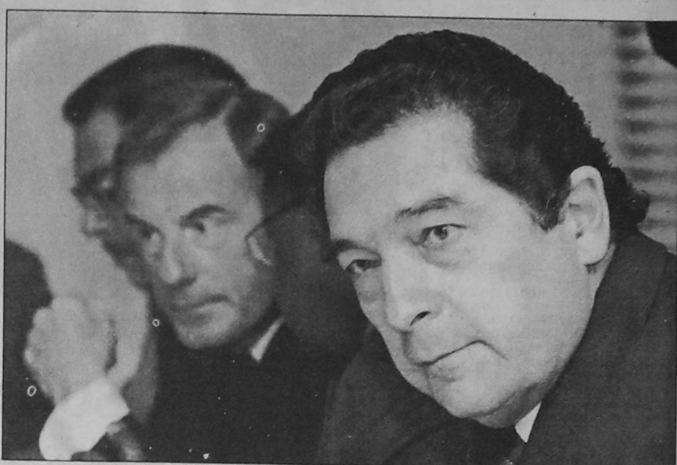
South African cricket chief Ali Bacher during the special meeting of the ICC at Lord's in London yesterday. England and Wales Cricket Board chairman Lord MacLaurin (2nd from L) is also seen.