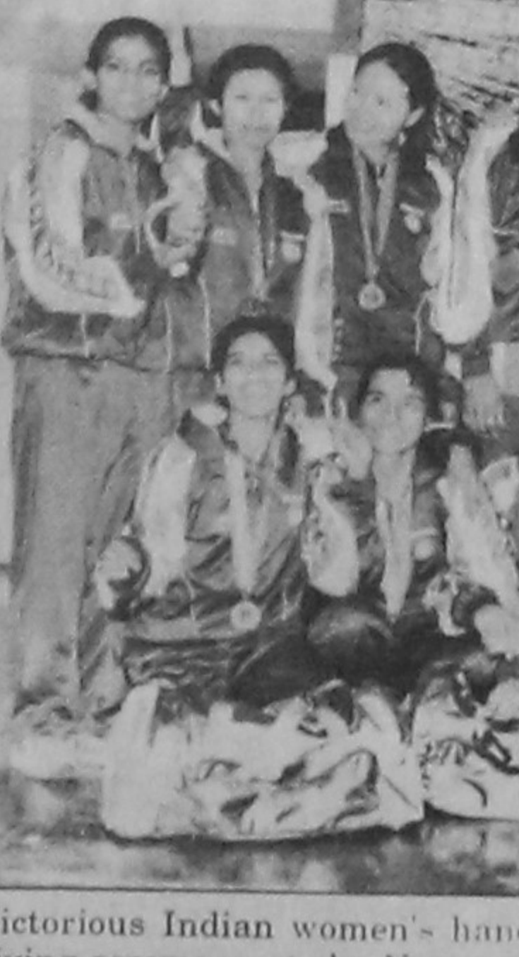
Victorious Indian women's handball team members pose with the trophy after the prize-giving ceremony at the National Indoor Stadium in Mirpur yesterday.