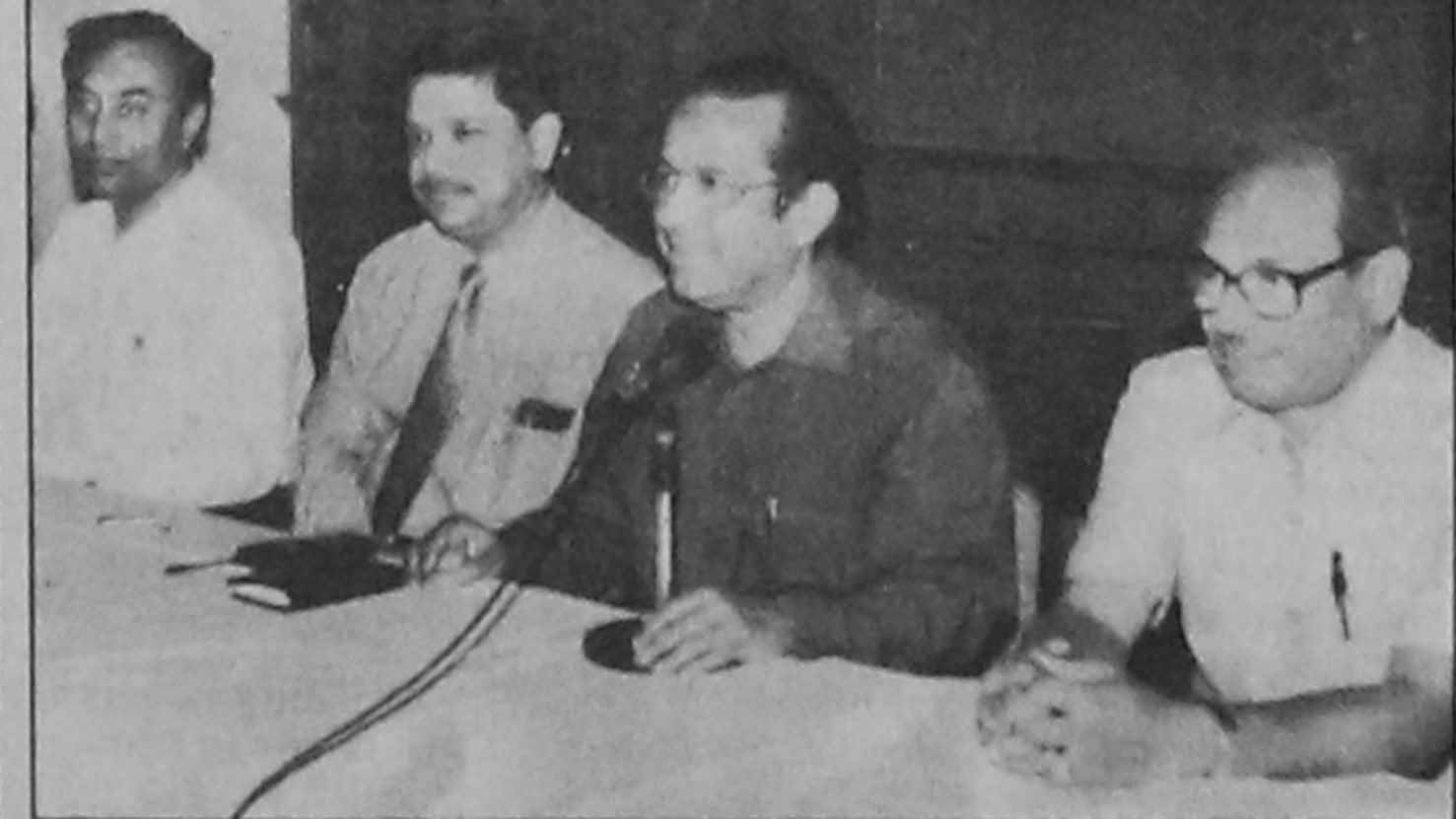
President of Bangladesh Scouts Manzoor Ul Karim speaking at a function in the National Press Club yesterday on the occasion of National Nutrition Week. Bangladesh Integrated Nutrition Project organised the event.