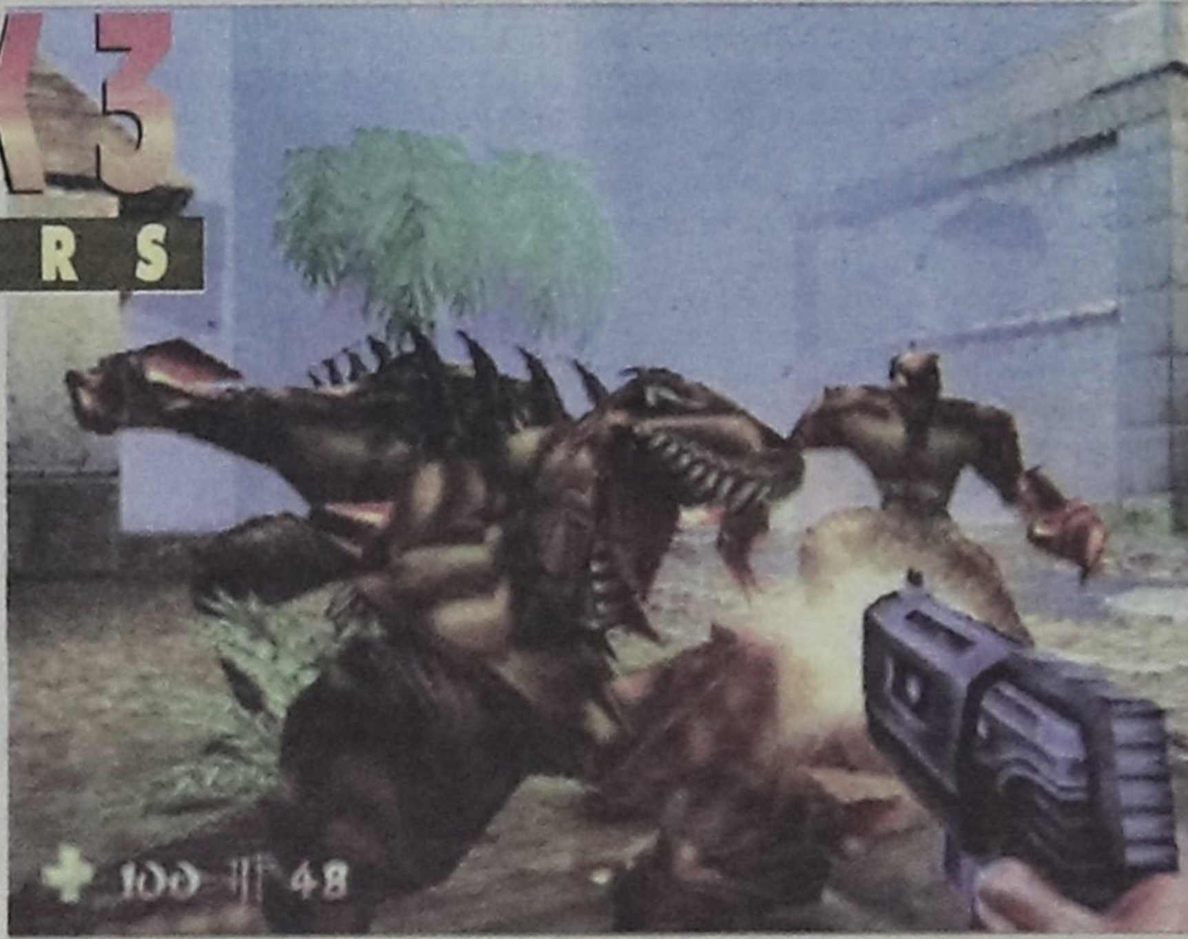
PC Game Review BY RA

The sound is perfect for all the creeping around that goes on. Your audio cues sometimes turn the tide in multiplayer games, where any indication of a camping gunman help you out. Beastly roars, sharp gunfire, thudding explosions, and even chattering chimpanzees are all crystal clear, but the ambient music could have been stronger, and you're stuck with it - pumping your own