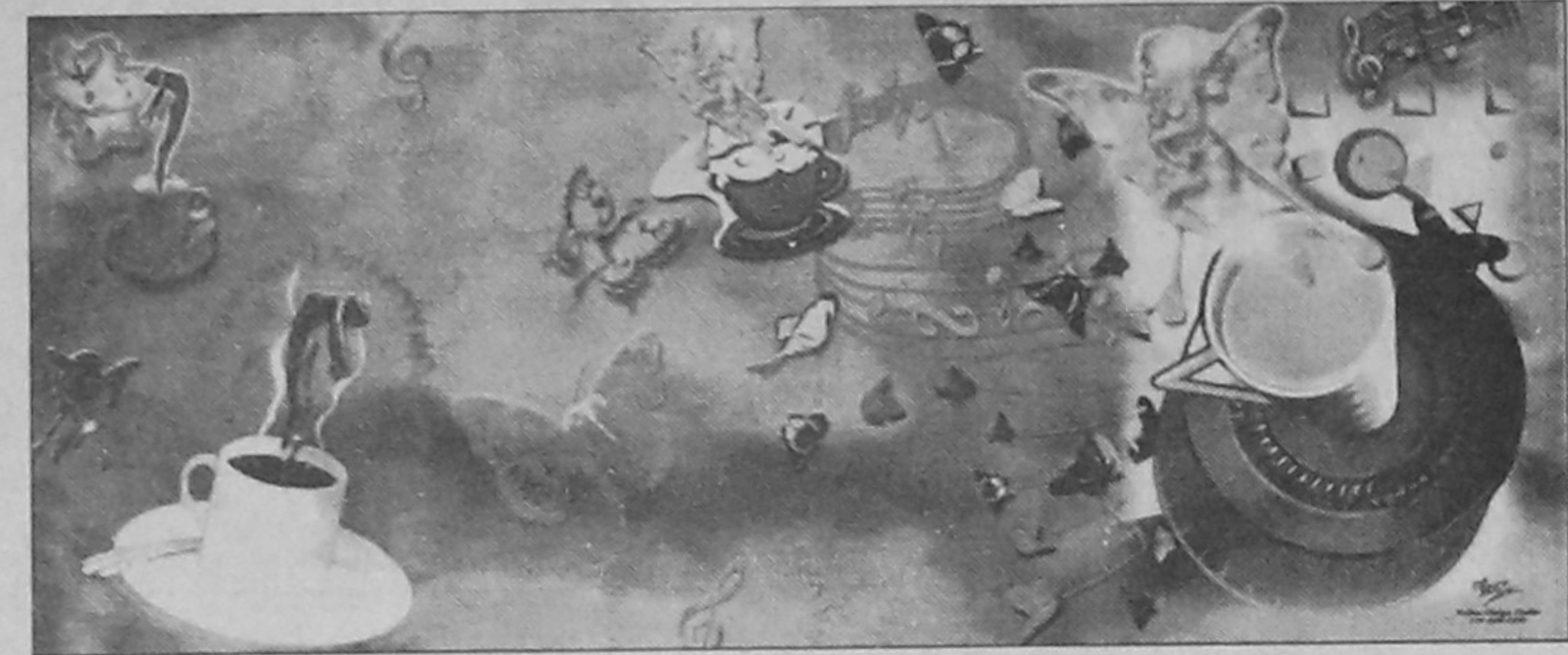
Joy of Coffee