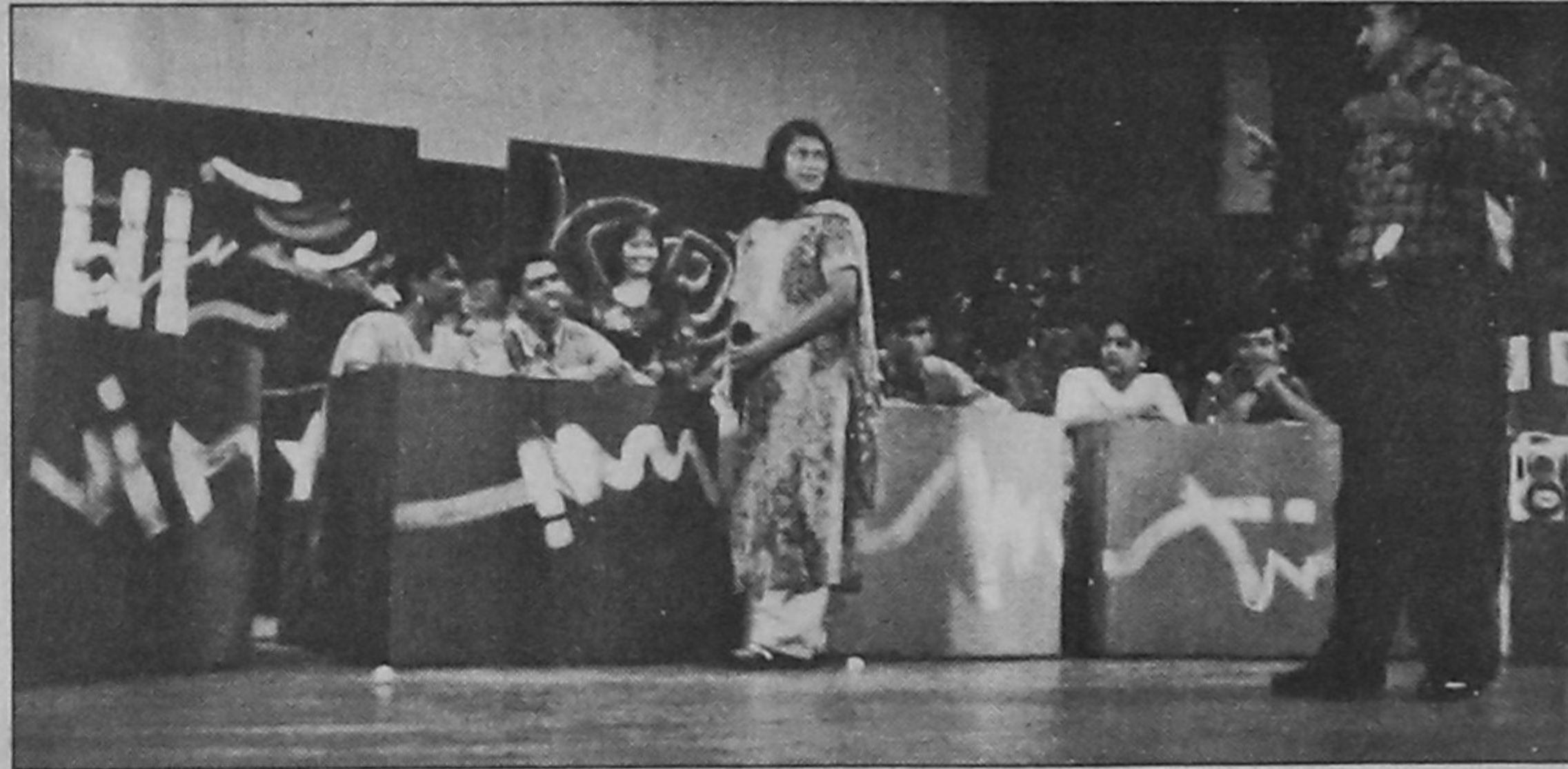
Super Quiz in Suveccha