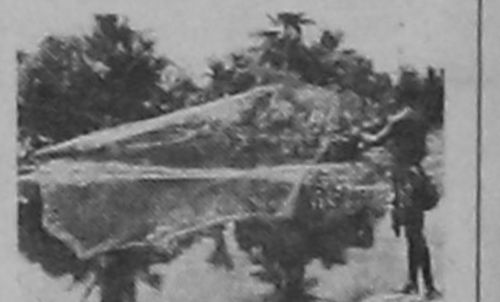
Calcutta: People and Nature

The exhibition will remain open to all from 10.00am till 8.00pm till April 30.