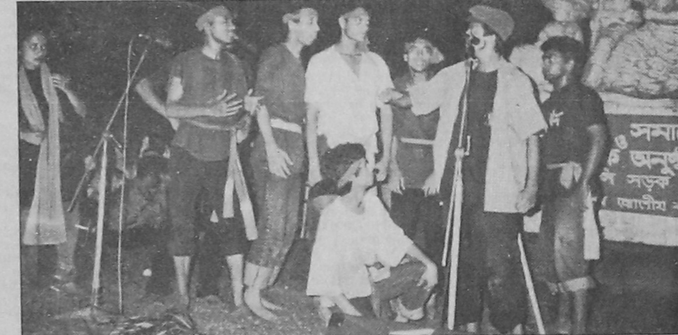
A scene from the drama 'Machine'

Special theatrical presentation on the occasion of May day