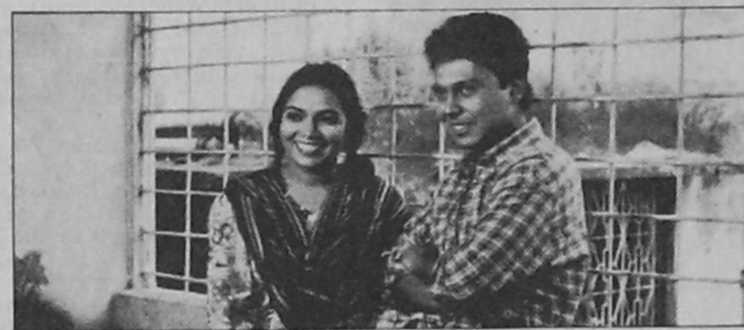
A scene from the drama series Durer Aakash