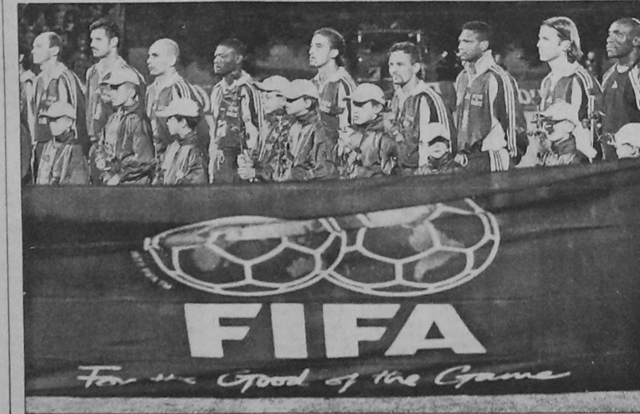
GATHER FOR A NOBLE CAUSE: Players of the FIFA World XI and orphans from an SOS village in Sarajevo line up during a ceremony prior to the start of the friendly football game against Bosnia on April 25.

The competition will be held in league basis.