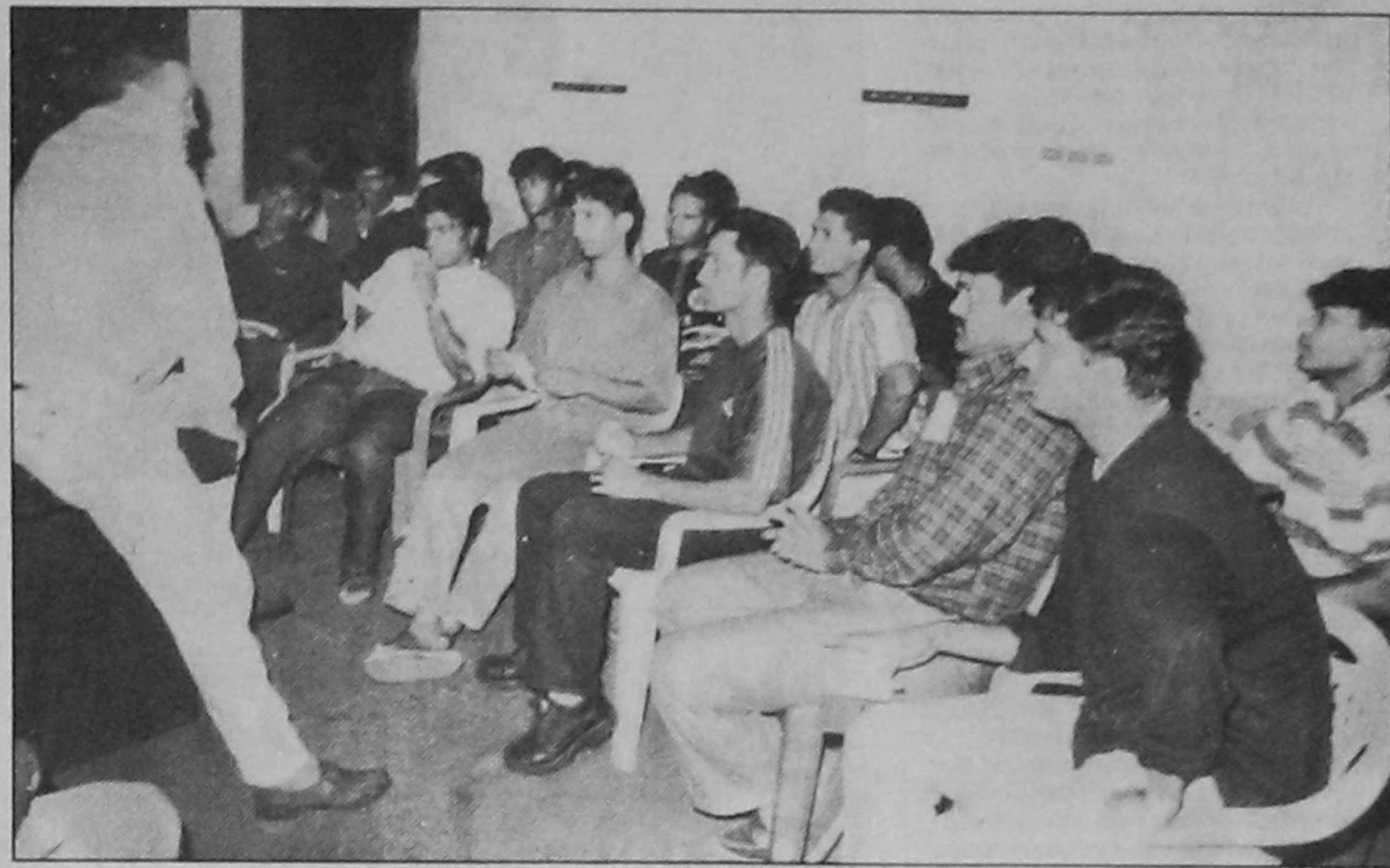
LISTEN UP BOYS: Eddie Barlow, the South African coach of the national cricket team, explaining the training schedule to the called up 24 players, who reported at the BCB office yesterday.

Abahani Krira Chakra will take on Alde Club tomorrow at the same venue.