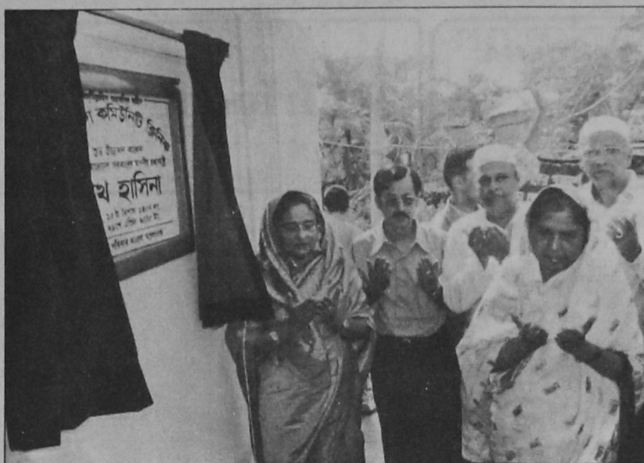
Prime Minister Sheikh Hasina offering munajat after inaugurating the first community clinic at Gemadanga village in Tungipara yesterday.

He died of cardiac arrest on Saturday in Sylhet Circuit House.