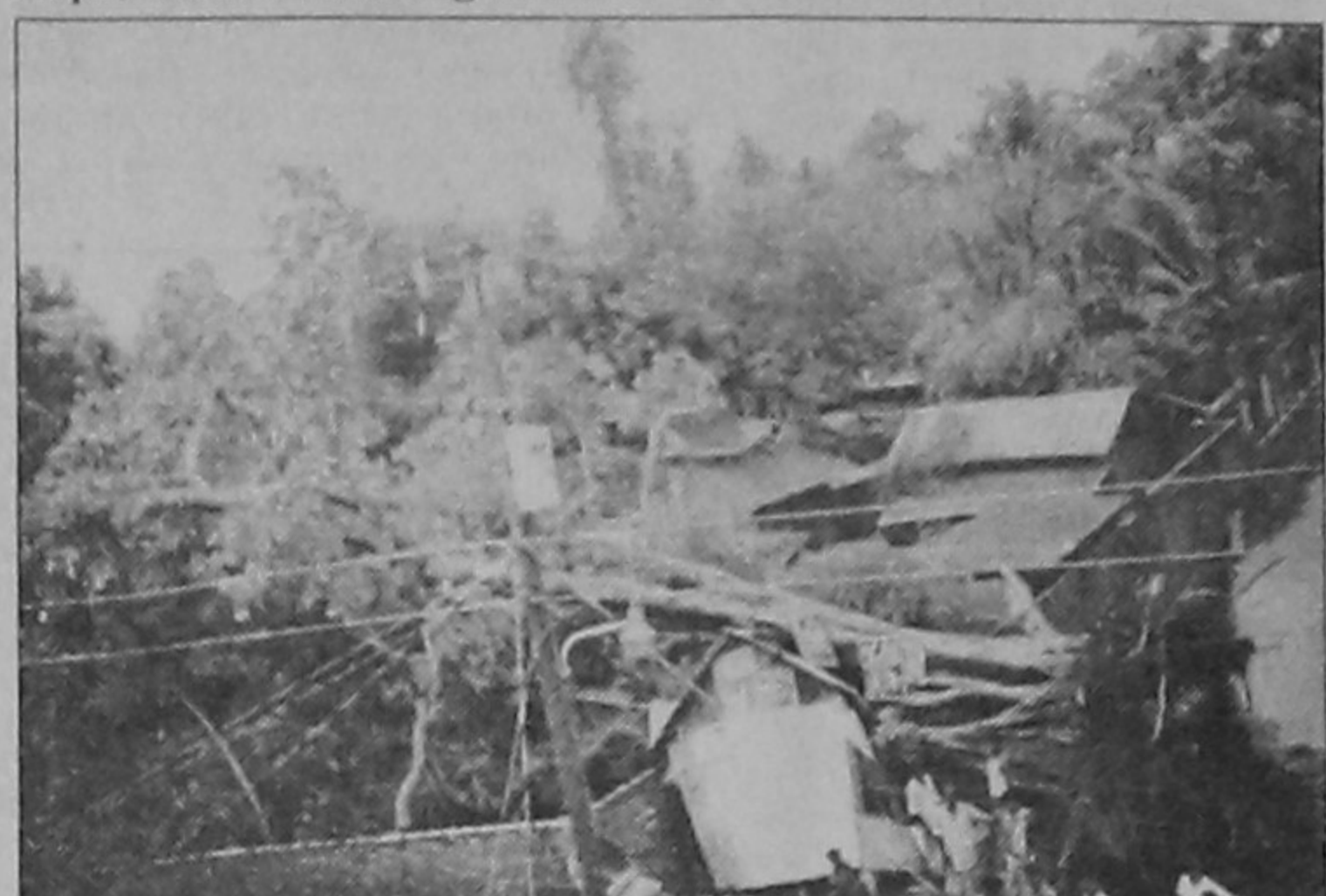
An old banyan tree was uprooted by a nor'wester which lashed recently Pukurpara area under Shahjadpur Municipality.

However, casualties of human lives have not been reported.