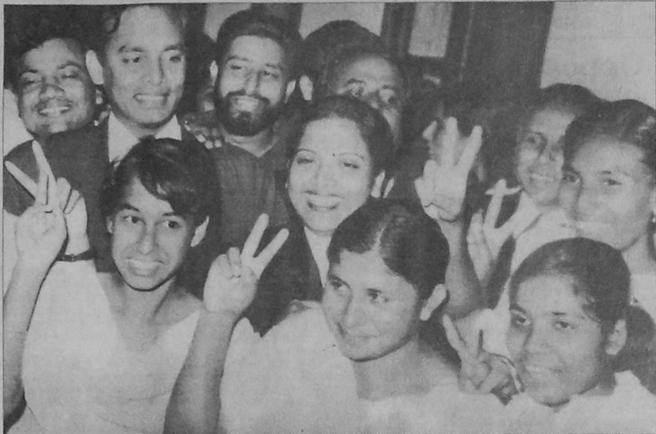
Students of Motijheel Model High School and College show V-sign at the High Court building yesterday. The court ordered the Dhaka Education Board to allow the 132 students of the institution to sit for H.S.C examinations beginning today.