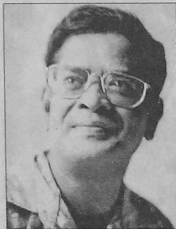
Humayun Ahmed