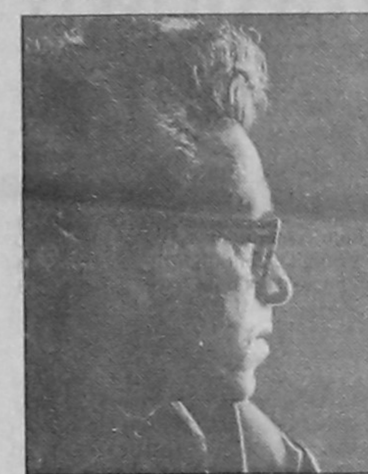
Shamsur Rahman