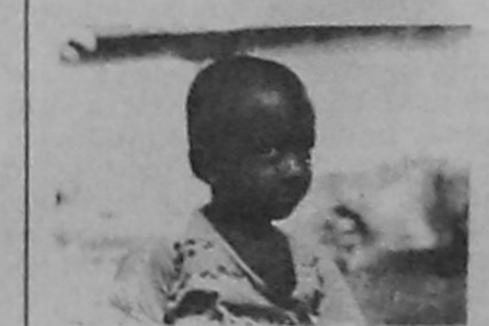
Calcutta: People and Nature

The exhibition will remain open to all till May 9.