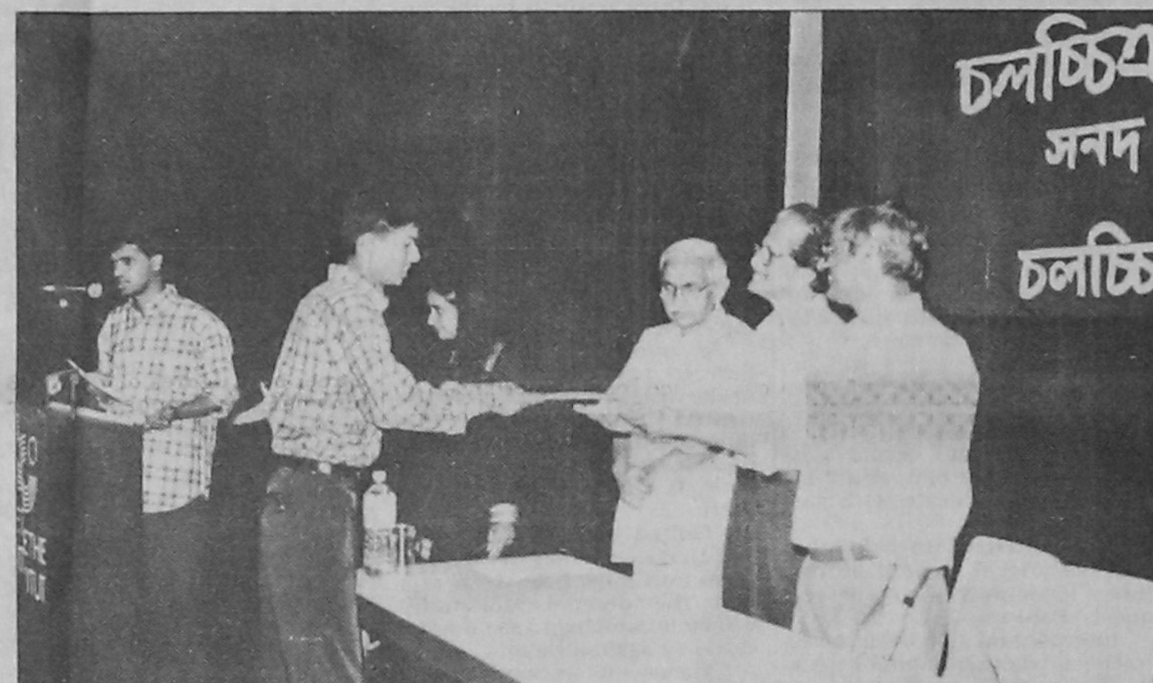
Award giving ceremony of the Chalachitram Film Society's workshop