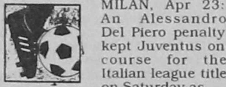
they beat Fiorentina 1-0 to stay five points clear at the top, reports AFP.