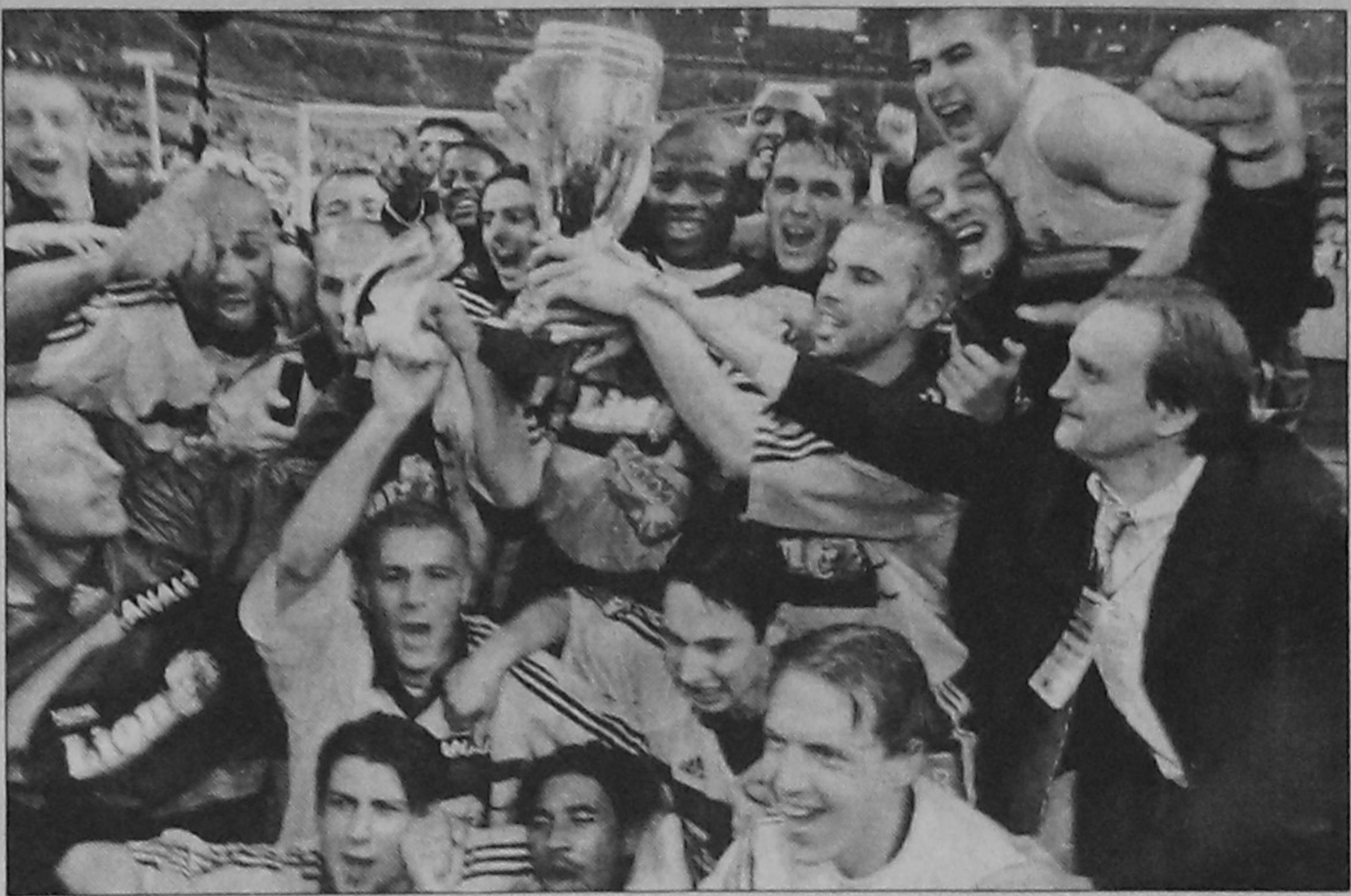
FC Gueugnon players have a party with the French League Cup trophy after defeating Paris St. Germain in the final on April 22. Gueugnon won 2-0.

Man-of-the-match: Sherwin Campbell. Third final: Port-of-Spain, April 23.