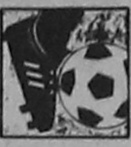
LONDON, Apr 23 (AFP): Sir Alex Ferguson said on Sunday his desire to make Premiership champions Manchester United even better will never die.

Rangers can move some 20 points clear at the top with a win on Sunday and whoever succeeds Barnes this summer must recognise the damage sustained this term cannot surely be repaired overnight.