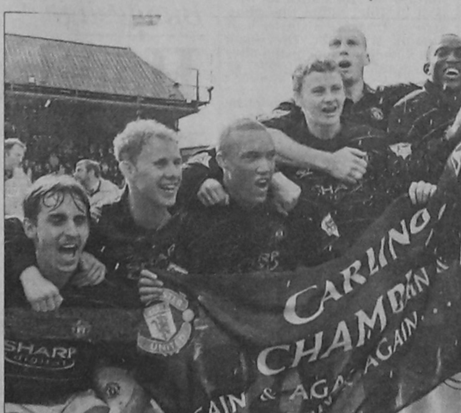
Players of Manchester United celebrating after ensuring this year's Premiership title when they beat Southampton 3-1 at Southampton on April 22.

"It gets harder every year," said the Welsh midfielder. "If