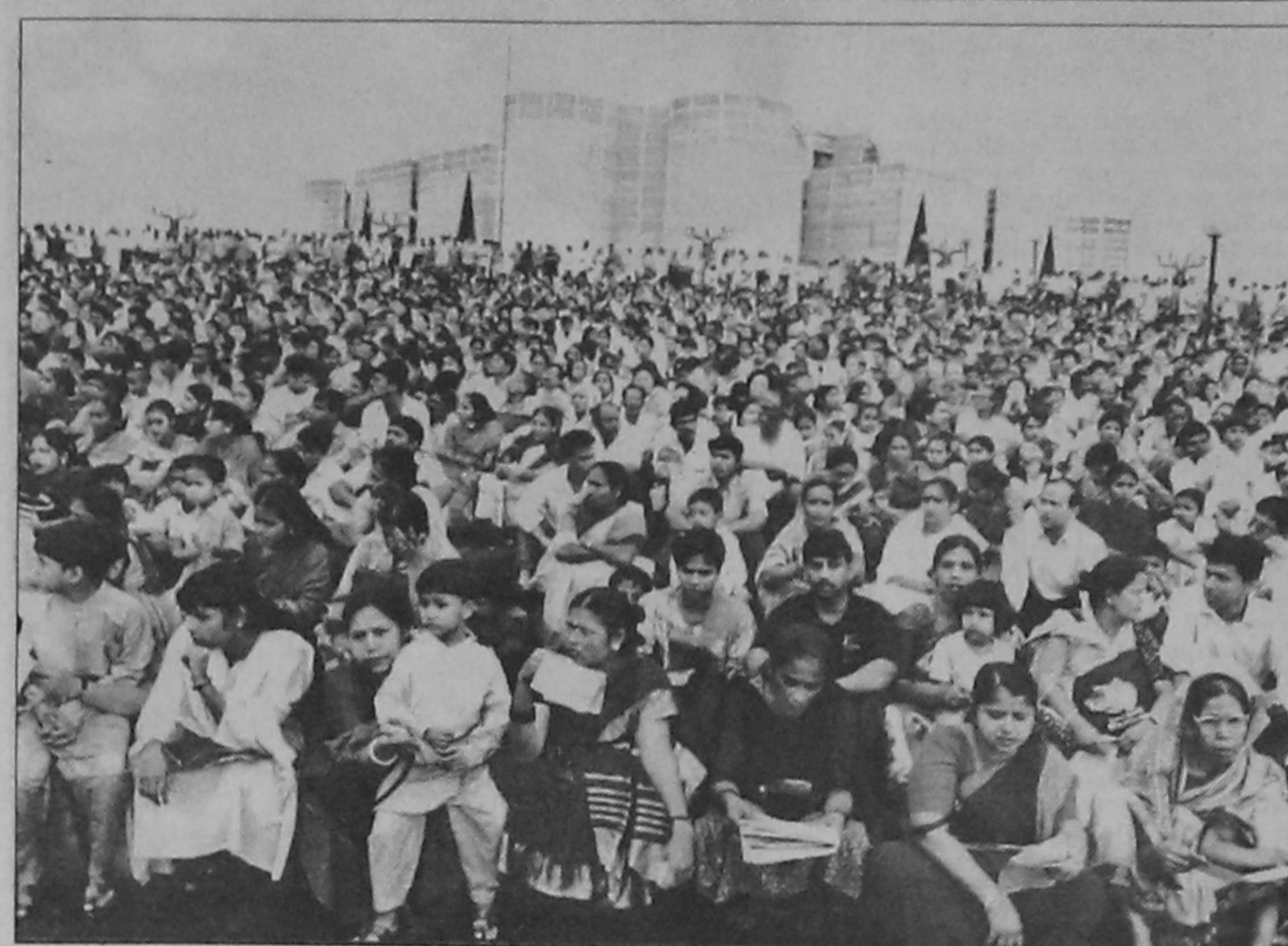
Members of the Christian Community at a prayer session on South Plaza of the Sangsad Bhaban on the occasion of Easter Sunday yesterday.

The sources said that the two units of Raozan power plant require over 470 personnel for operation and maintenance but there are only 200 now.