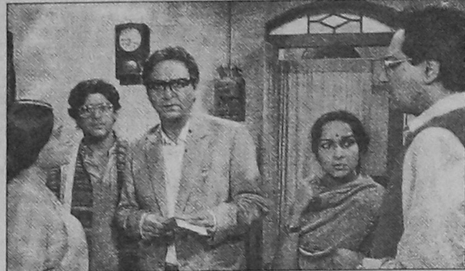
'Ganoshotru' another of Satyajit Ray's films.

The films to be screened are: today: Kanchenjunga , April 24: Jalshaghar (The Music Room), April 25: Devi (The Goddess), April 26: Charulata (The lonely wife), April 27: Nayak (The Hero), April 28: The Music of Satyajit Ray (Rabindranath Tagore, Samapti, Postmaster, Monohara (The three daughters), April 30: Chiriakhana (The Zoo), May 1: Mahanagar (The Big City), May 2: Pratidwandi (The Adversary), May 3: Seemabaddha (Company Ltd), May 4: Jana Aranya (The Middle Man), May 6: Satyajit Ray , Kapurush O Mahapurush (The Coward and the Holy Man), May 7: Aranyer Dinratri (Days and Nights in the Forest), May 8: Ashani Shanket (Distant Thunder), May 9: Shatranj Ki Khilari (The Chess Players), May 10: Ghare Bairey (Home and the World), May 11: Gana Shatru (The Public Enemy) and May 12: Agantuk . (The Stranger).