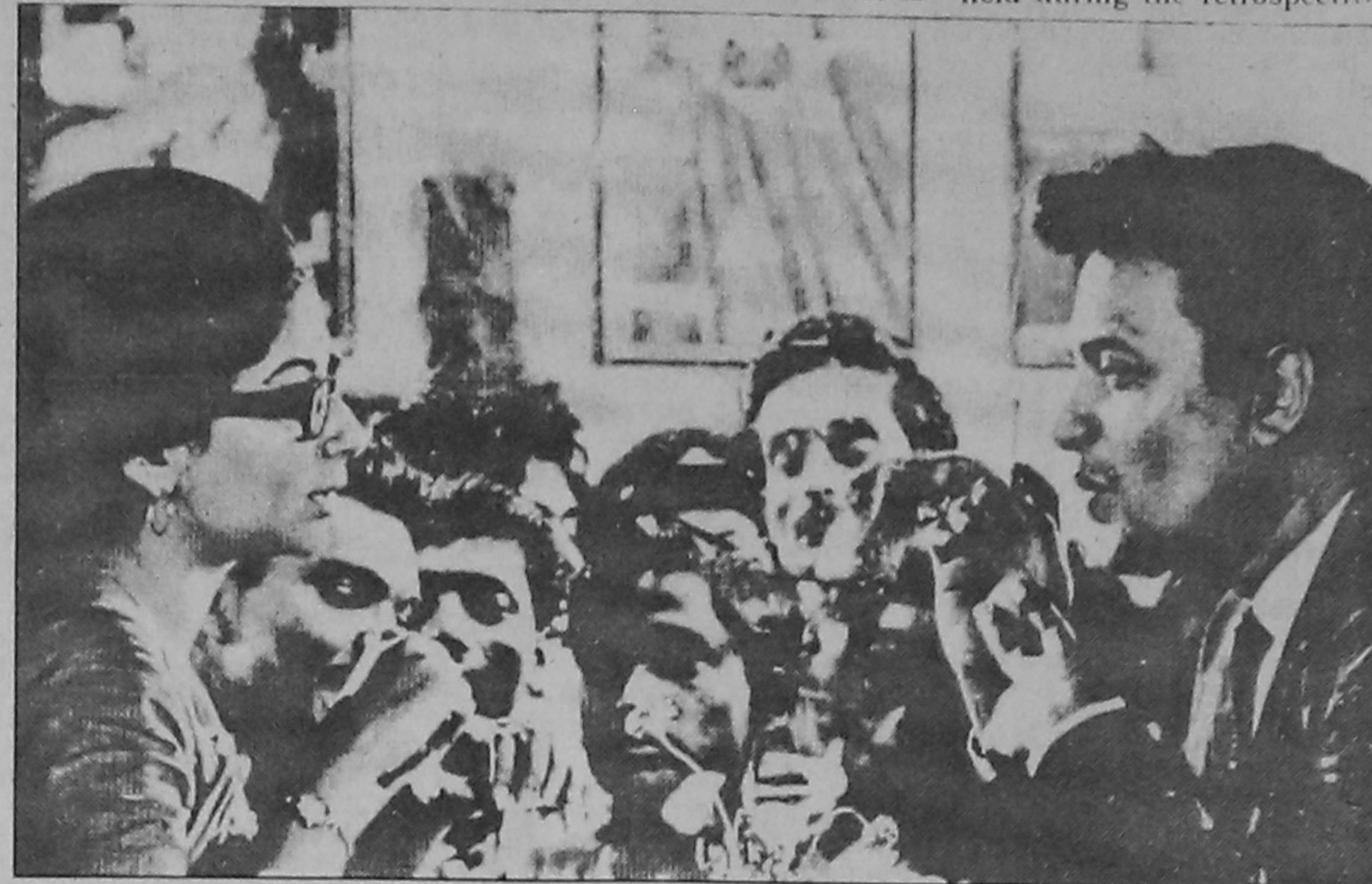
Utam Kumar and Sharmila Tagore in a still from Nayak .