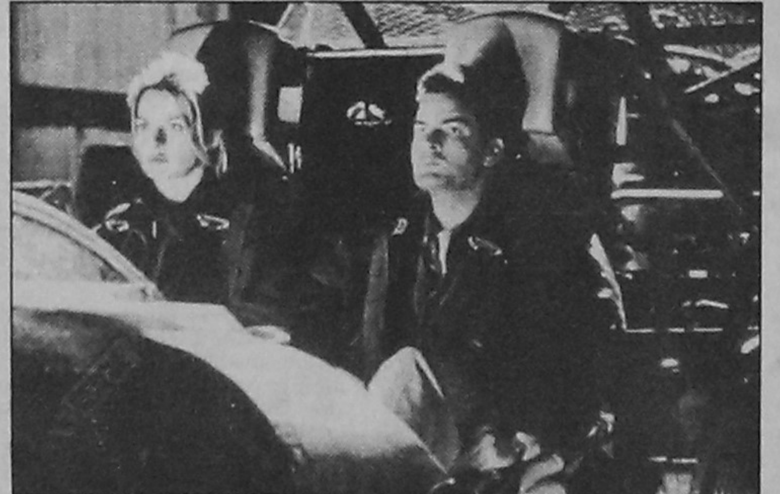
Terminal Velocity on Star Movies at 10.00 pm.

STAR WORLD 7:00 Crystal Maze 8:00 Mr. Belvedere 8:30 Lassic 9:00 The Adventures of Sinbad 10:00 Small Wonder 10:30 Doogie Howser 11:00 Series: Xen Warriors Prences 12:00 Series: Hercules 1:00 Series: J. A. G. 2:00 Series: Waker Texas Ranger 3:00 How Bizarre 3:30 Travel Asia 4:00 WWF Super-