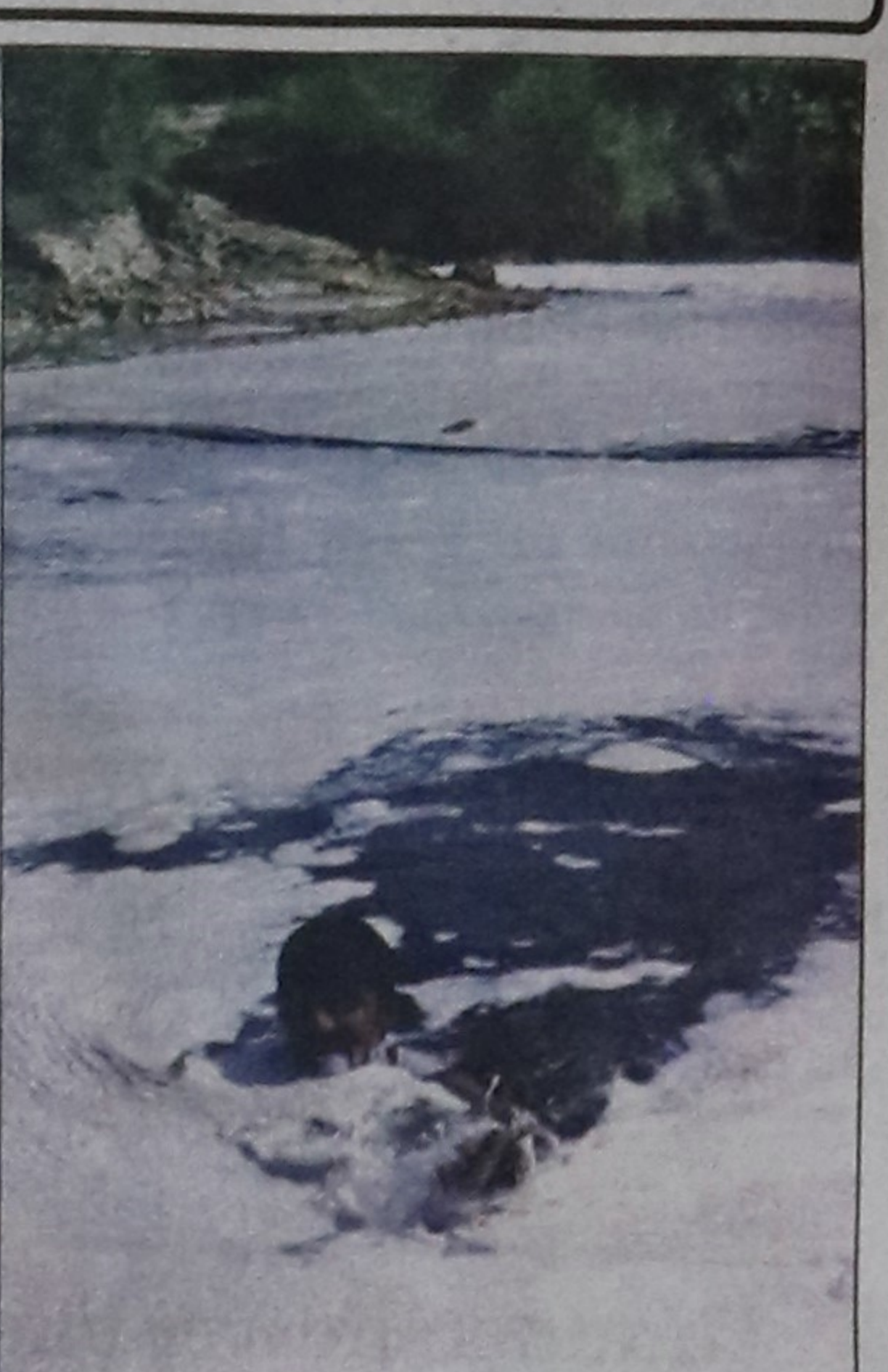
Bangladesh observed the 'Earth Day' yesterday pledging to protect the fragile mother earth. But unabated industrial pollution threatens the country's rivers. A Department of Environment survey identified like froth on the water, (3) river current sweeping the chemical waste to the Bay of Bengal and (4) a man searches for dyed fish in the polluted water.