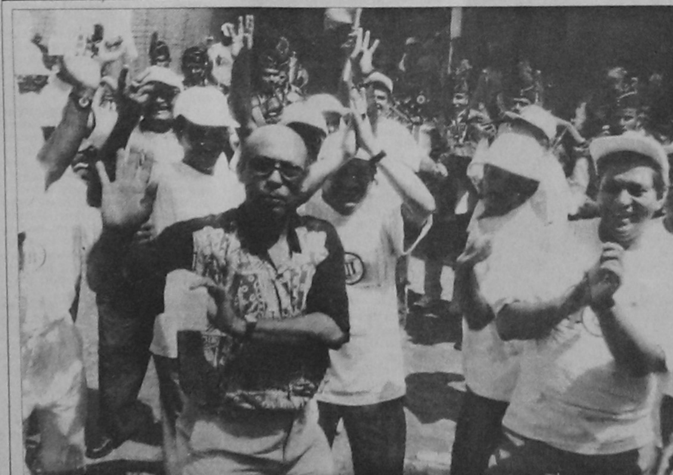
AGE NO BAR! Senior members of Wari Club are bubbling in enthusiasm as a rally of them parades through the city streets to mark the inauguration of the club's five-day centenary celebrations yesterday.