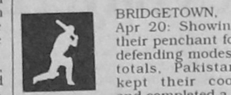
AKRAM ... m-o-m