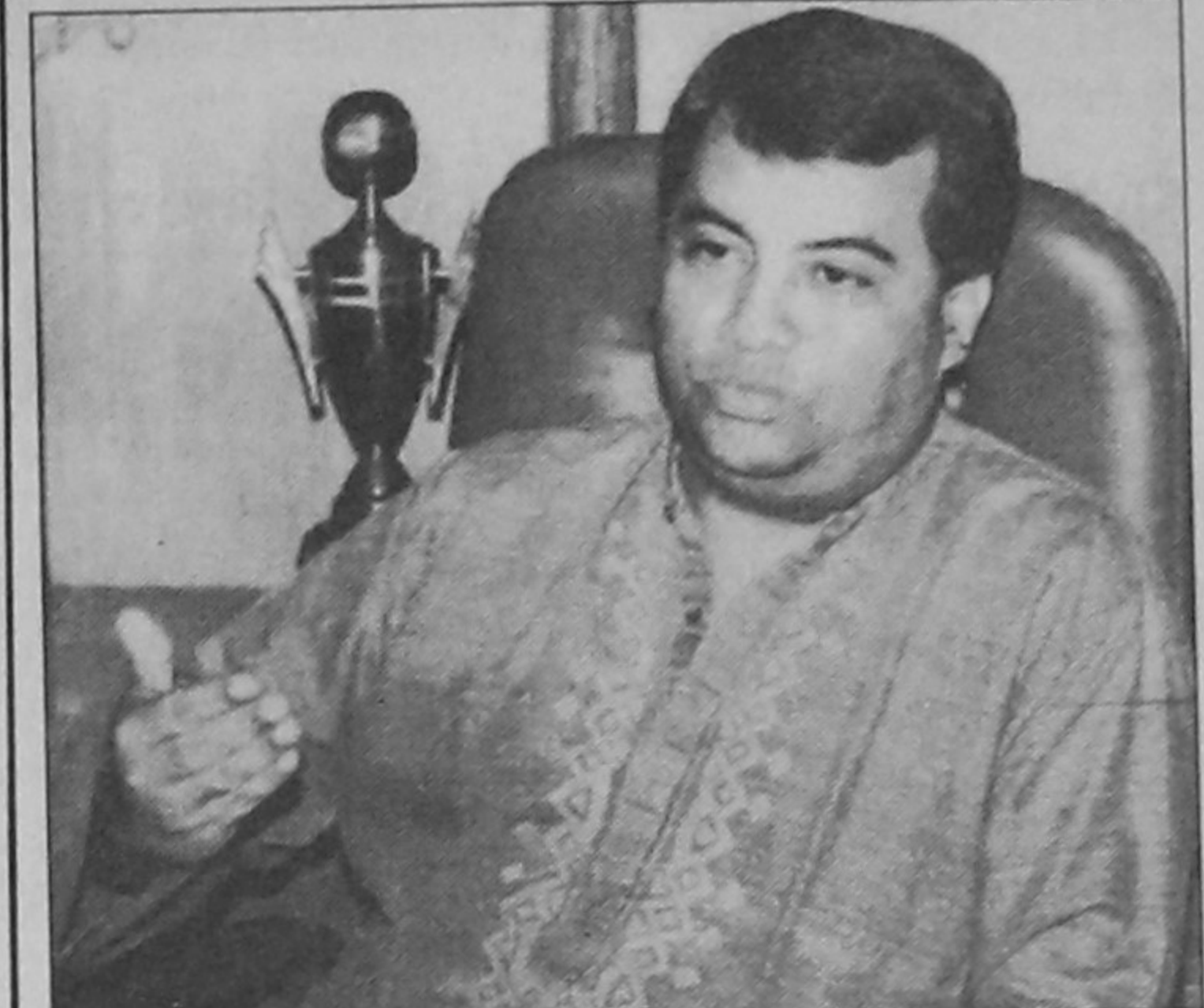
Bangladesh Cricket Board president Saber Hossain speaking to reporters during a briefing at the Bangabandhu National Stadium yesterday.

Saber disclosed that he would raise the point of restructuring the BCB at a meeting on April 17.