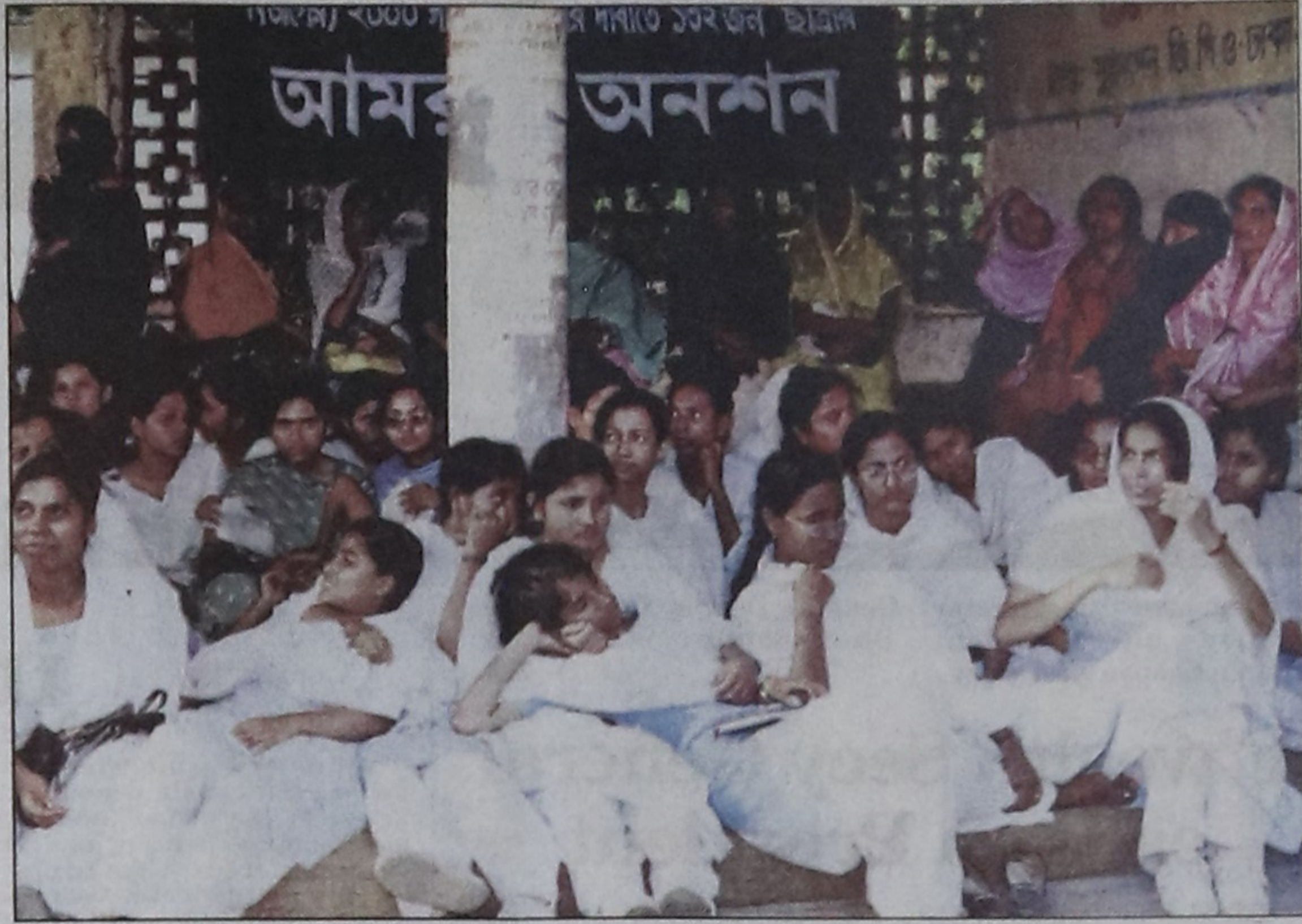
Testing time The 132 students of Motijheel Model High School and College during their fast-unto-death programme at Mukhtangan yesterday.