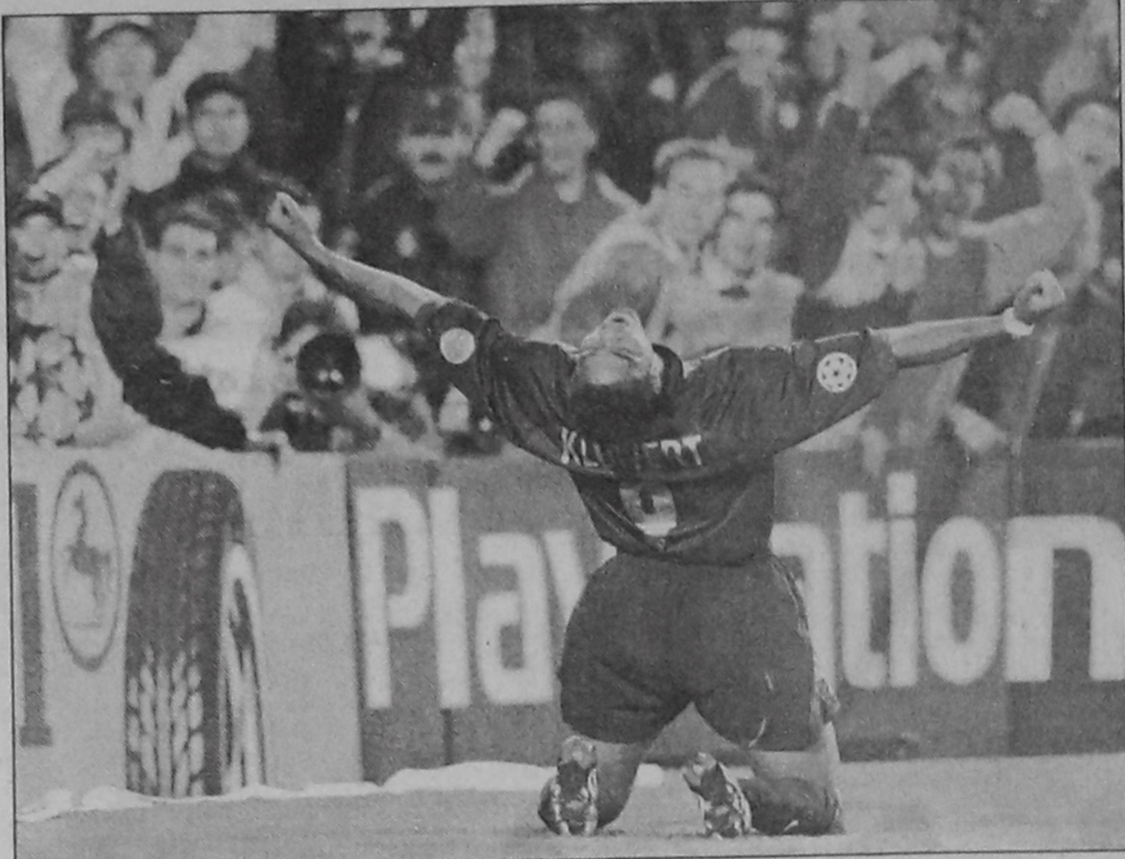
THANK YOU FOR EVERYTHING: Barcelona striker Patrick Kluivert is ecstatic as he looks towards the heavens after scoring the fifth and last goal against Chelsea at the Nou Camp on April 18.

Delhi police believe at least nine alleged bookies may have been involved in match-fixing and betting during the India-South Africa clashes in February and March.