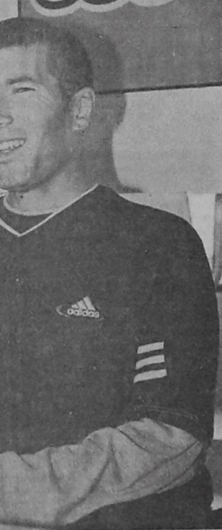
Zinedine Zidane, Juventus' French superstar smiles during a media conference at the Stade de France in Saint-Denis on April 18.

national for a long time. I congratulate them," Zidane said.