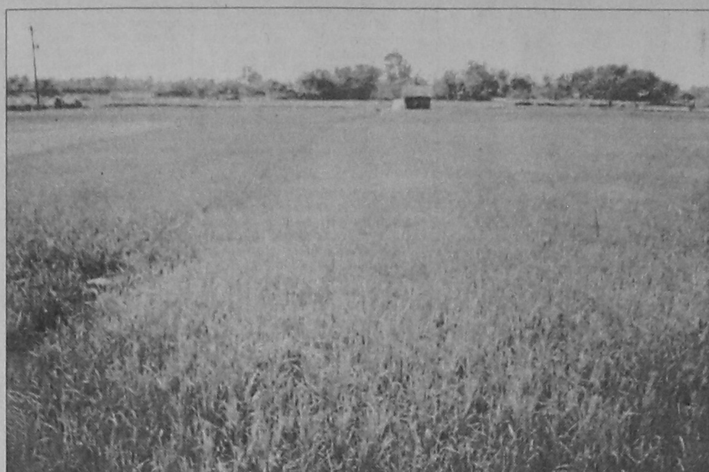
Weather favours farmers

Officials said the farmers were inspired in boosting Boro