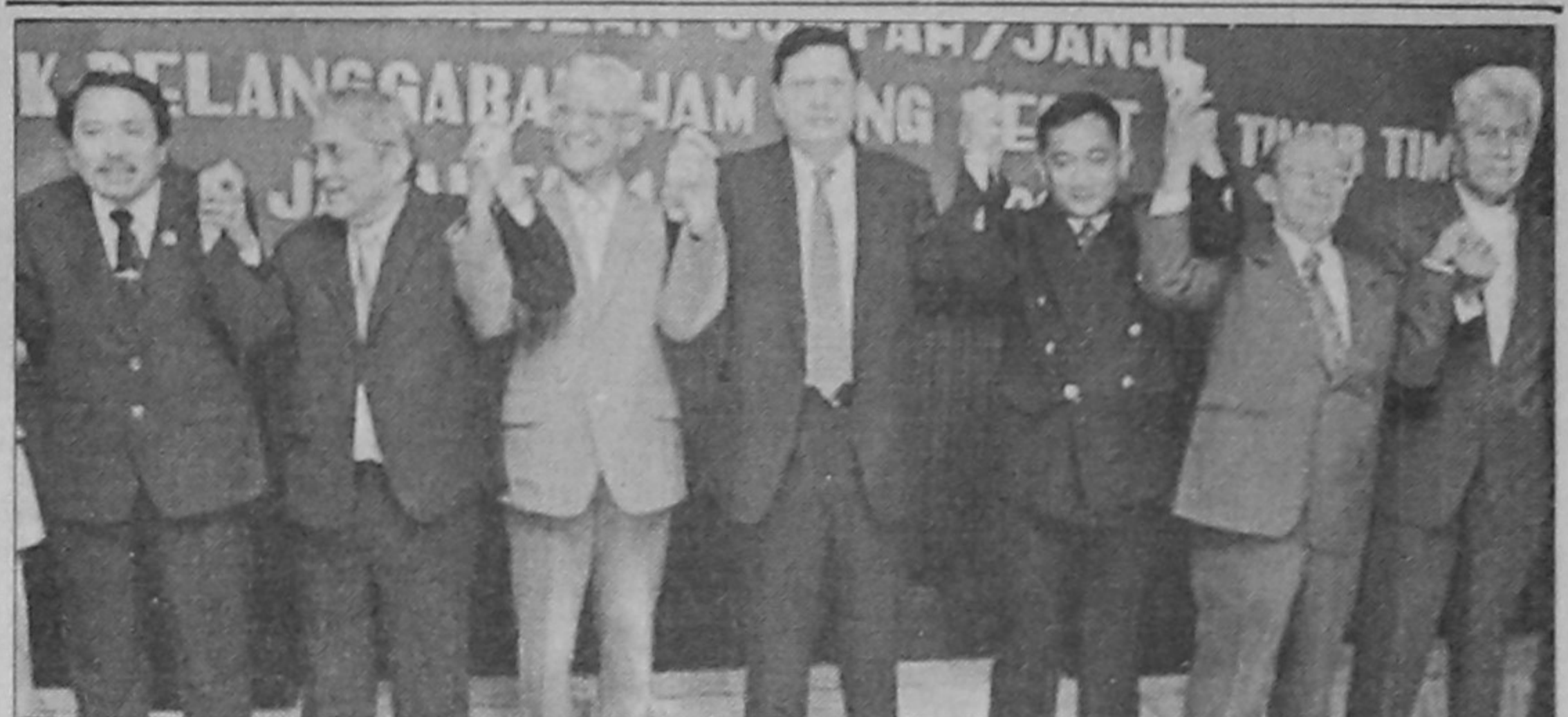
Indonesian Attorney General Marzuki Darusman (4th L) poses with members of a team yesterday comprising of lawyers, human rights activists and officials tasked with investigating the violence in East Timor last year. The team was earlier sworn-in in a ceremony at the attorney general's office.

The NAB, which launched a campaign to recover unpaid bank loans, has so far recovered 16 billion rupees (320 million dollars) from the defaulters, he said.