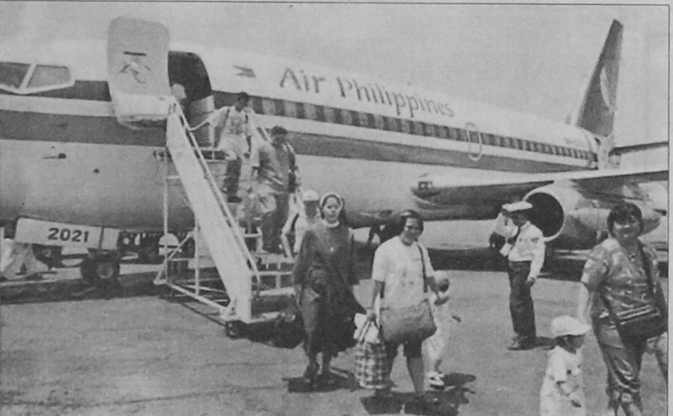
Passengers disembark from an Air Philippines Boeing 737, similar to the passenger jet which crashed yesterday in the southern Philippines on a domestic flight between Manila and the southern city of Davao killing all 131 passengers and crew on board.

The combat formations of the Liberation Tigers of Tamil Eelam launched a major offensive thrust in the army controlled areas... (and) the LTTE forces are advancing deep into the area."