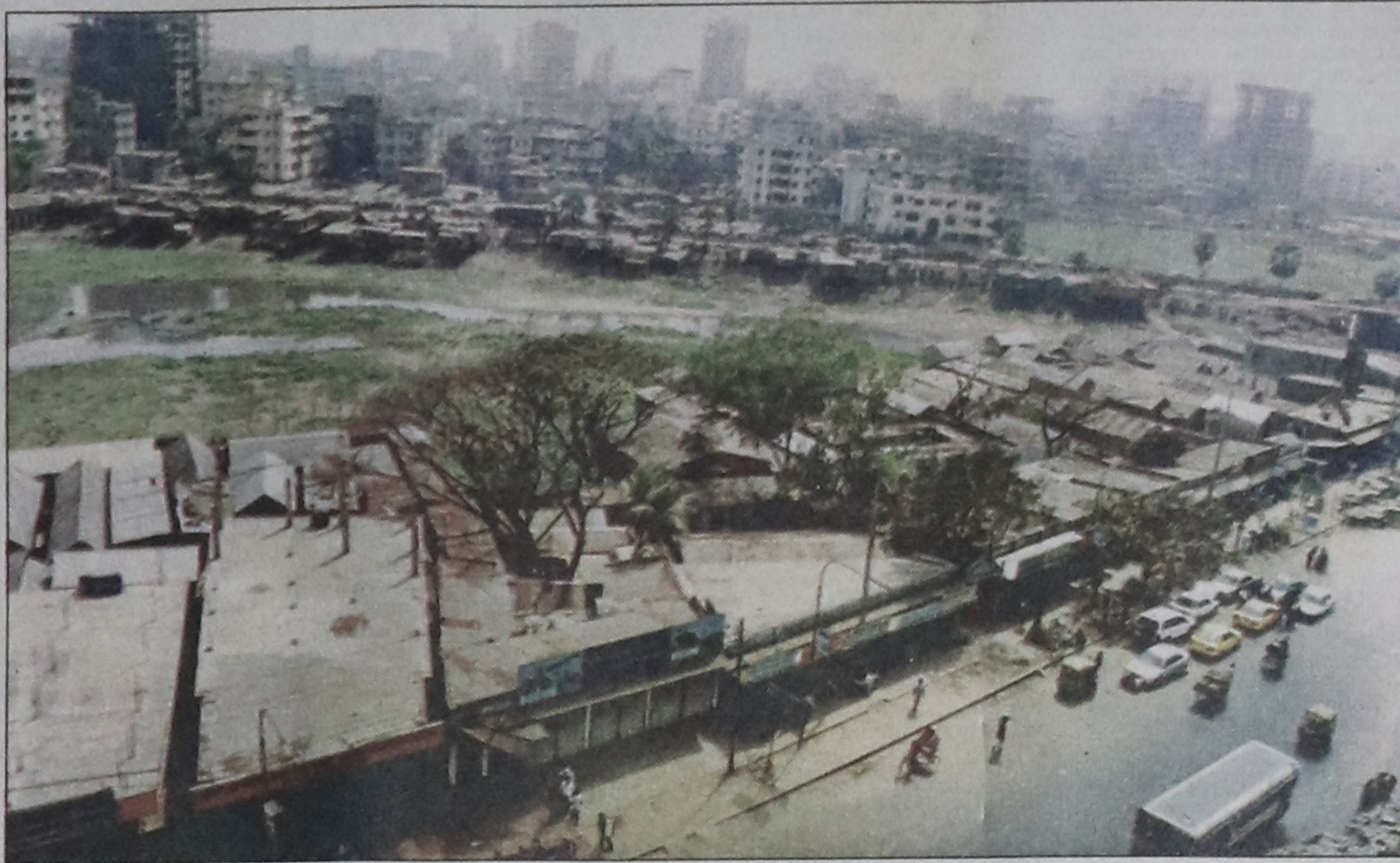
The government demolished the slum behind Sonargaon Hotel, but residents, with nowhere else to go, have already started rebuilding it.