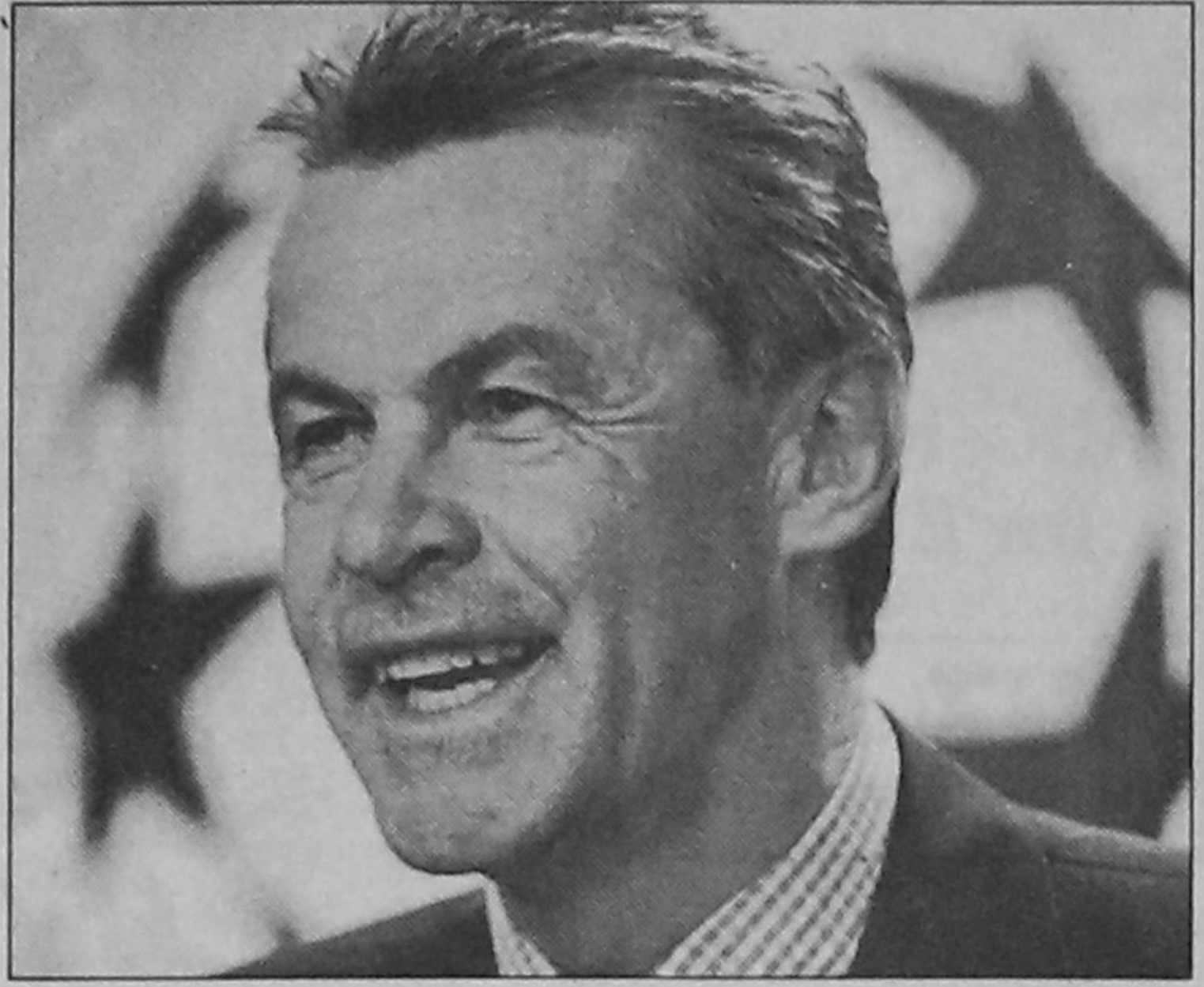
Bayern Munich coach Ottmar Hitzfeld speaking during a press conference in the German city yesterday. Bayern face Portuguese side FC Porto in Champions' League second leg quarterfinal today.

tos, hopes to welcome back defender Secretario, will rely heavily on Brazilian forward Mario Jardel, on target in a 2-0 weekend win at Santa Clara which sent the side to within two points of leaders Sporting Lisbon.