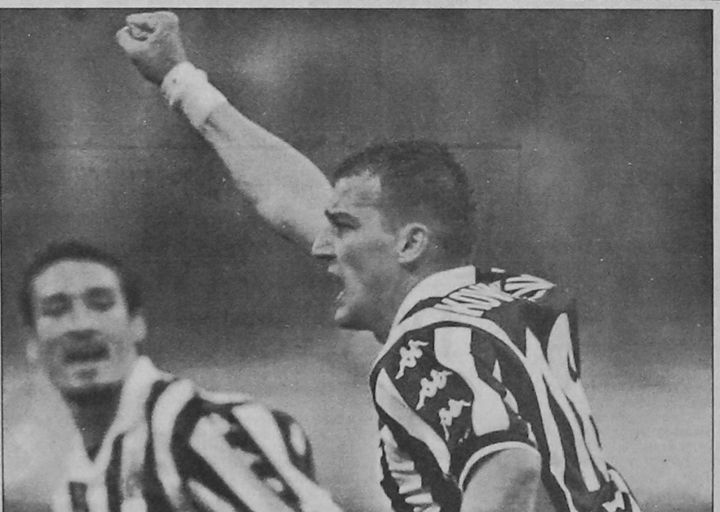
NEW SENSATION: Juventus' Yugoslav international striker Darko Kovacevic (R) is euphoric after scoring for a second time against Inter Milan during their Serie A fixture at the San Siro Stadium on April 16.

Jardel's phenomenal record of 122 goals in 119 games for the Portuguese since signing four years ago from Brazilian side Gremio of Porto Alegre is the visitors' only real hope of causing an upset. "It's no secret - Porto's game is based around Jardel," admits Santos.