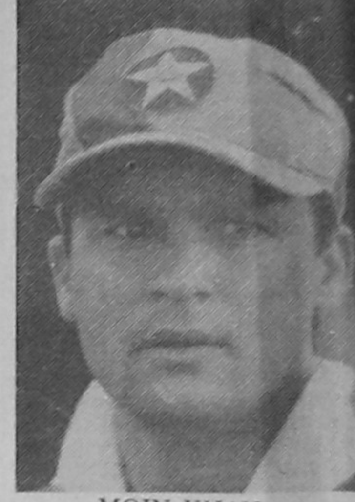
MOIN KHAN WEST INDIES (from): Jimmy Adams (captain), Shervin Campbell, Philo Wallace, Chris Gayle, Wavind Hinds, Ricardo Powell, Ridley Jacobs, Franklyn Rose, Curly Anderson, Nixon McLean, Reon King, Mahendra Nagamootoo, Laurie Williams, Sylvester Joseph.

that also involved Zimbabwe. Meanwhile, off-spinner Saqlain Mushtaq has left Karachi for the West Indies to join Pakistan for the finals.