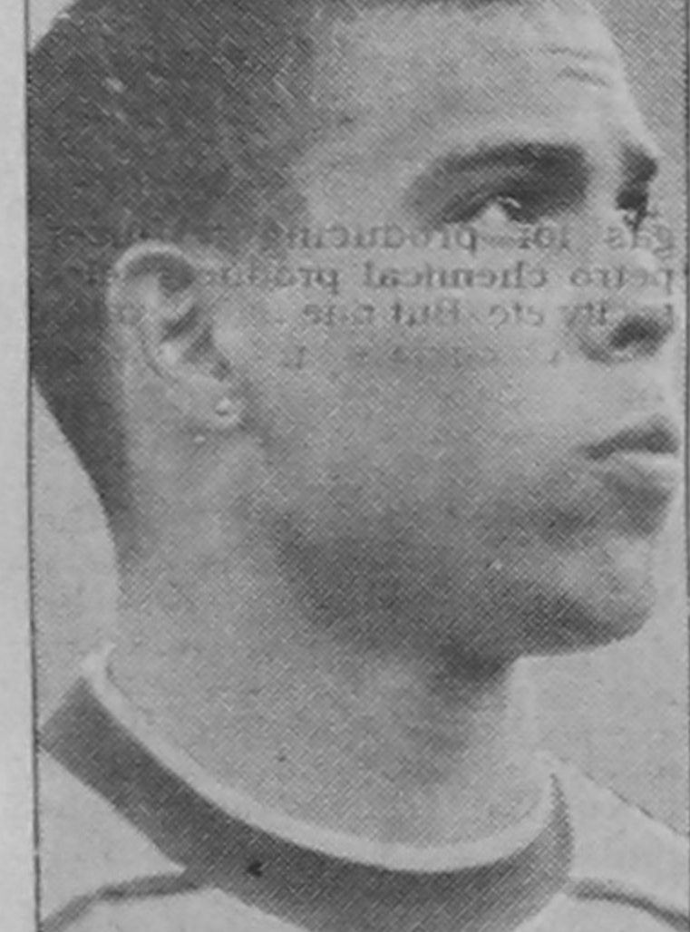
Ronaldo (Brazilian football superstar) "I've blamed no one. I've just cursed my bad luck." On his current state.