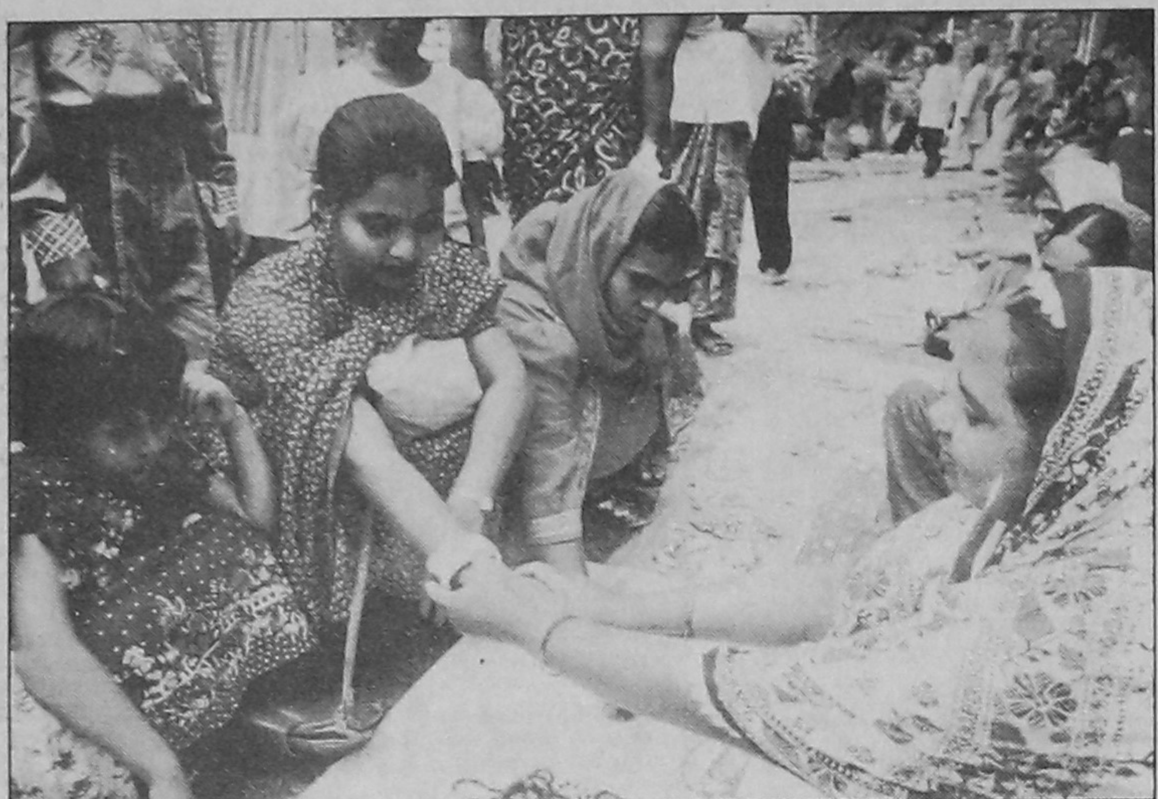
Visitors at the Baishakhi Mela (New Year Fair) at Ramna Park trying out (bead-laden) bangles. Modern forms of bangles have found their way alongside traditional glass bangles in recent times.