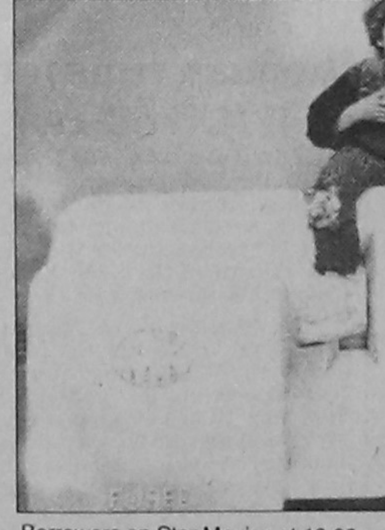
Borrowers on Star Movies at 10.00 pm

7:30 Aatma 8:00 Sant Asaram Wani 8:30 Ramayan 9:30 Hum Sab Ek Hain 10:00 Family No 1 10:30 I Love You 11:00 Dil Vil Pyar Vyar 11:30 Archana Talkies 12:30 Cine Matinee-Super Hit Film: 4:00 Udaan 4:30 Mahayagya 5:00 The Good Home Show 5:30 India Magic 6:00 Boogie Woogie 6:30 Cook It