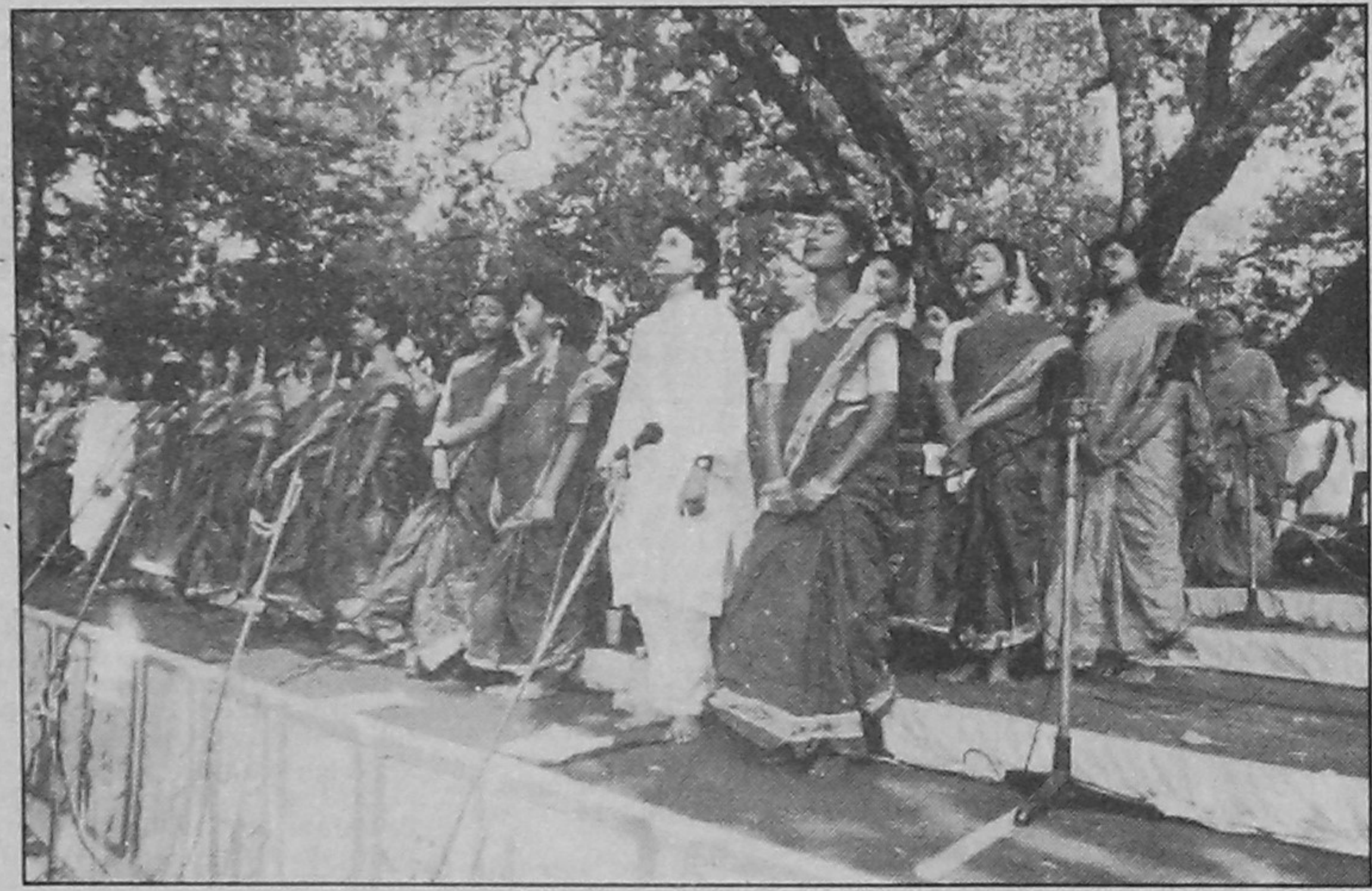
A tradition of songs: Students of Chhayanaut presenting songs at their traditional presentation under the banyan tree at Ramna Park in the early morning of the 1st day of the new year.