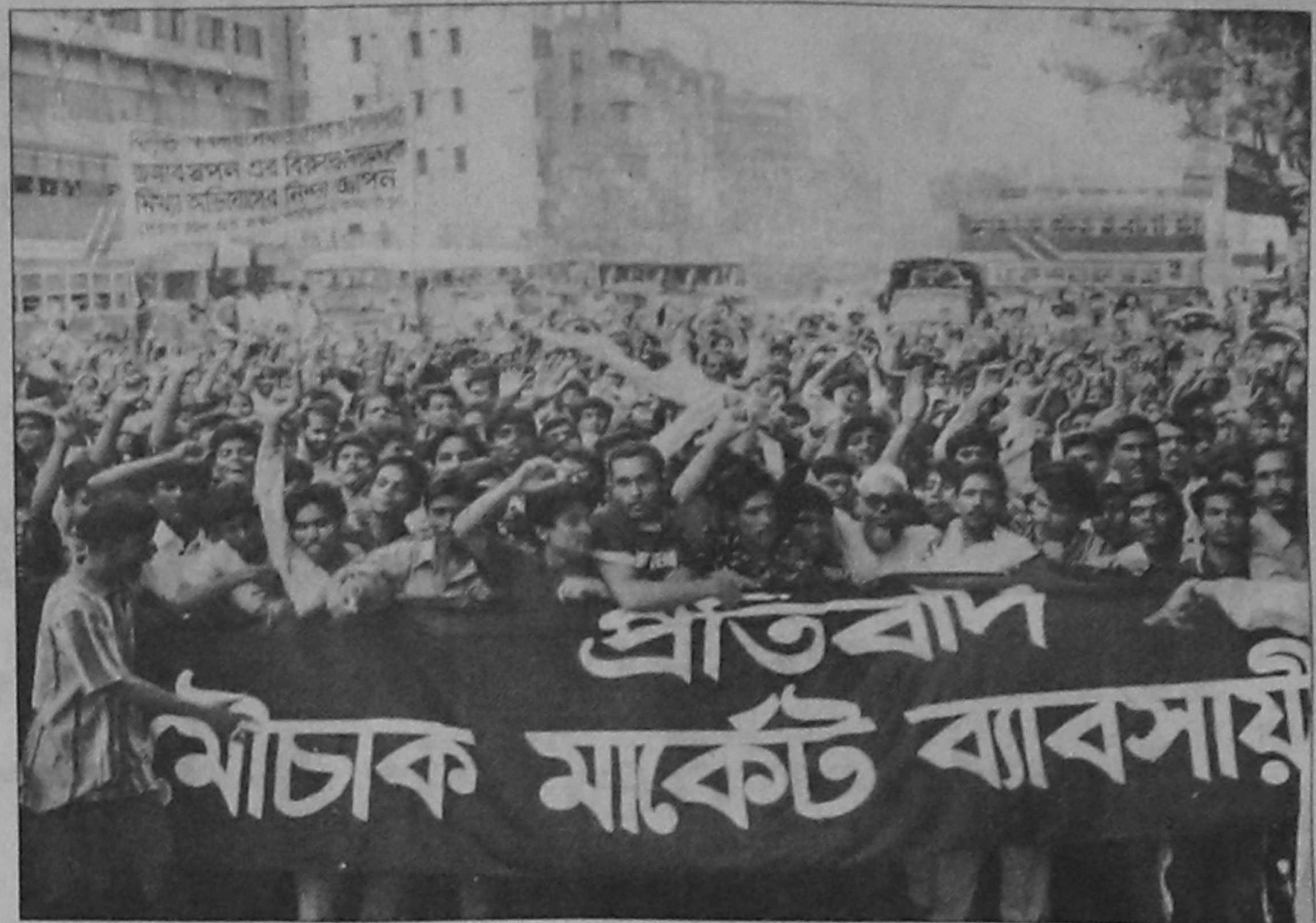
Mouchak Market Businessmen Samity brought out a procession in the city yesterday demanding withdrawal of false case against owner of a shop at the market.