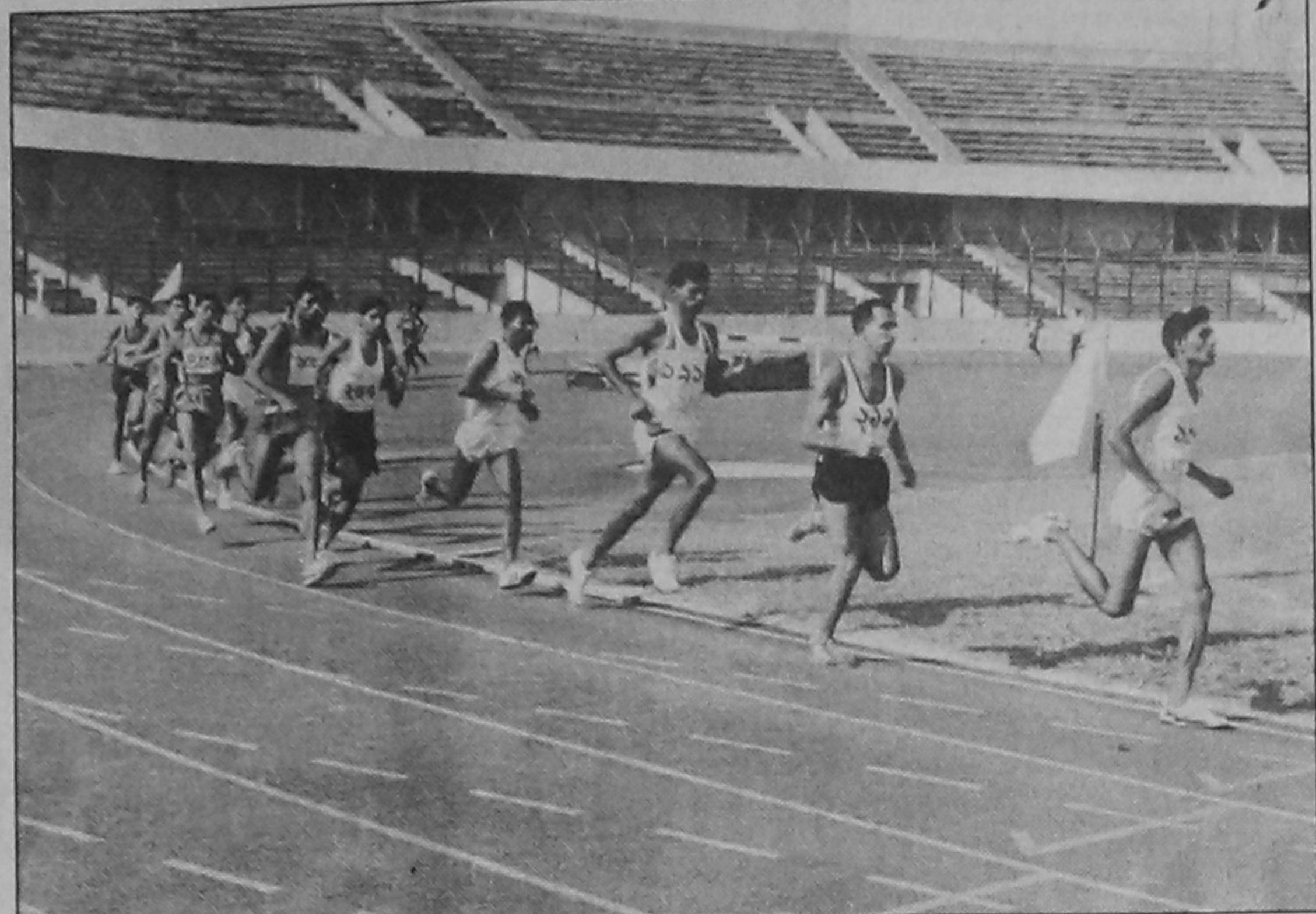
Participants in the men's 1,500m of the 26th National Athletics Championships at the Sher-e-Bangla National Stadium yesterday.

State Minister for Youth and Sports Obaidul Quader and president of Bangladesh Cricket Board (BCB) Saber Hossain Chowdhury left yesterday for South Africa on a five-day visit, reports BSS. They will get to know the administration, infrastructure and visit cricket facilities in the country. Also they will meet the South African sports minister, cricket board officials and exchange views with them. After leaving Johannesburg on April 17, they will go to Harare on a three-day visit to Zimbabwe.