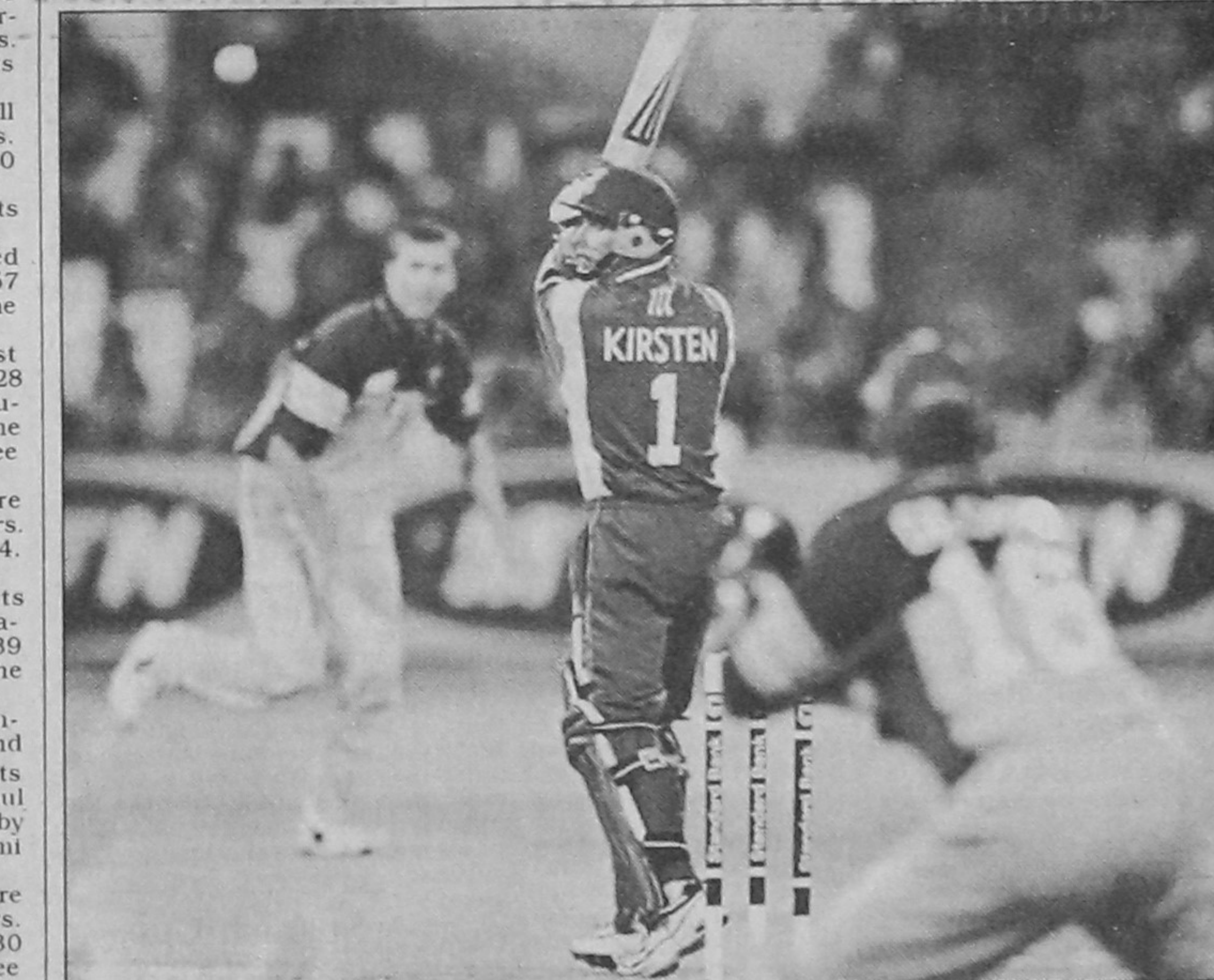
South Africa opener Gary Kirsten, who was adjudged man-of-the-match for a magnificent 97, flashes at a Glenn McGrath delivery during the first one-day international against Australia at Kingsmead on April 12.