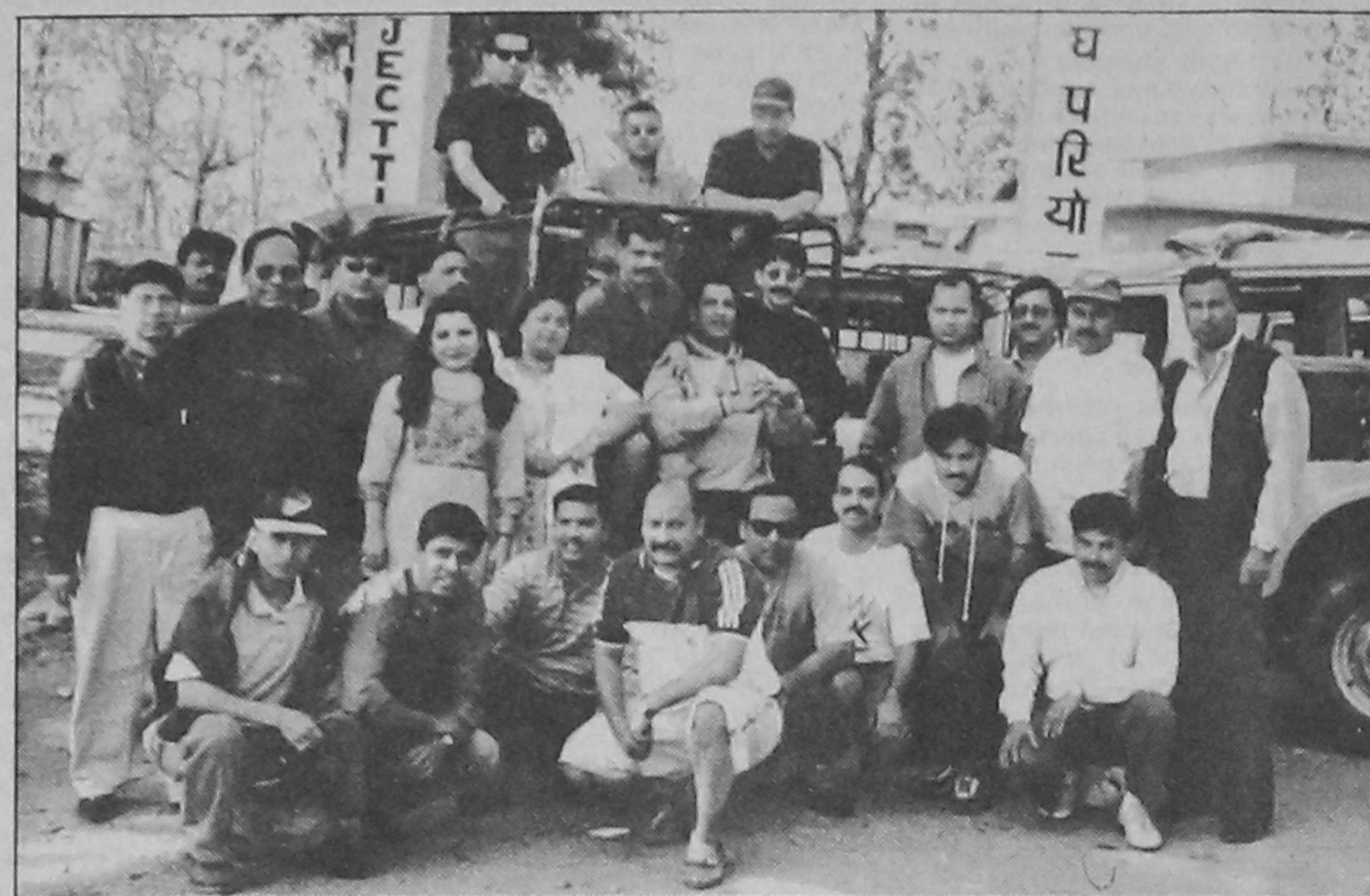
British Airways staff seen with their top producing agents from Dhaka, Chittagong and Sylhet at Jim Corbett National Park, an Indian wild life resort. British Airways recently hosted the trip for the agents to India.

In the last two years, rates of duty on raw materials were reduced substantially in many cases, but there are still many raw materials where duty is higher than the imported finished products, the Chamber said.