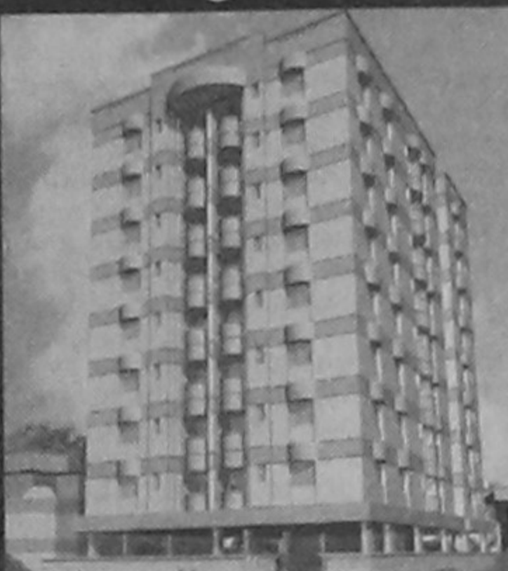
TRIAD- Lake Circus