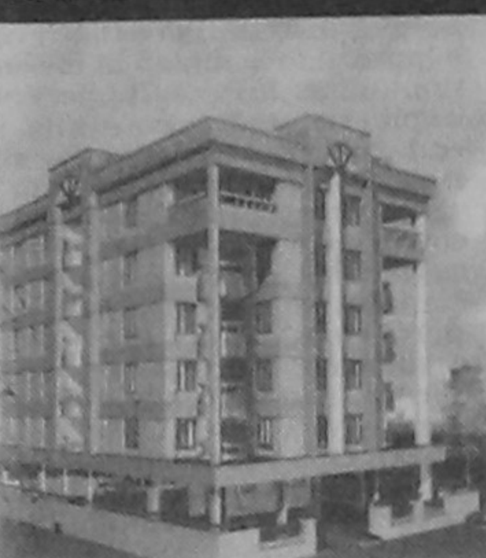
CROWN - Gulshan