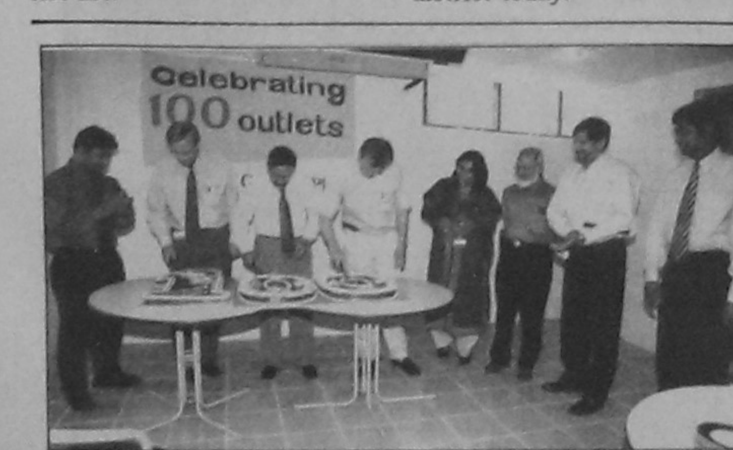
GrameenPhone executives are cutting cakes to mark the opening of 100th GP outlet.

"The activities of any social organisation should not be concentrated in traditional courses" the state minister said and urged his audience to make special efforts against exploitation, corruption and social inequality, now plaguing the social life.