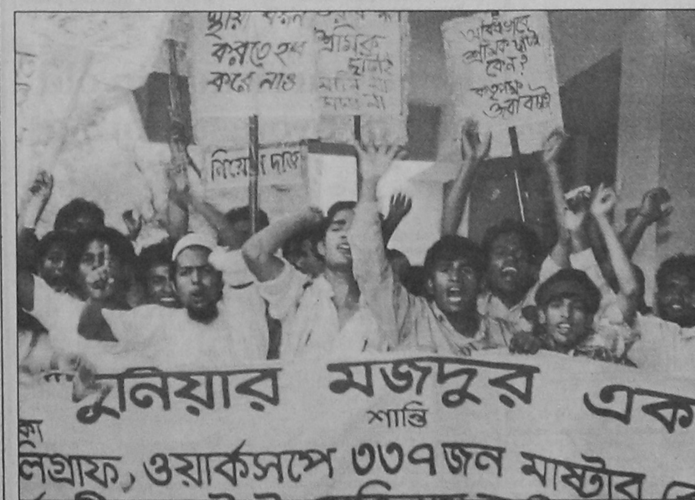
Workers and employees of T&T brought out a procession demanding regularisation of their colleagues yesterday.

On information police rushed to the spot and caught the three from the house.