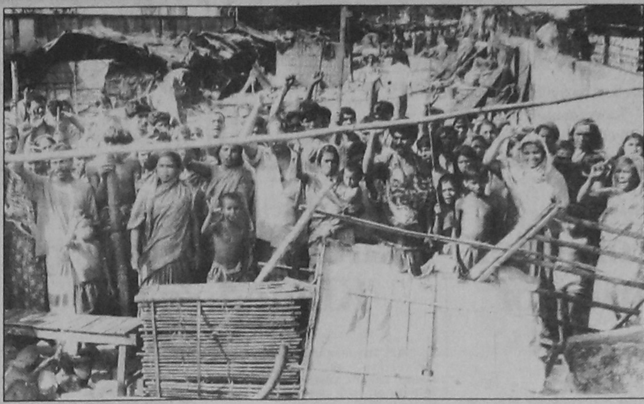
'We want rehabilitation.' The inmates of Paribag box culvert slum staging a protest yesterday, demanding resettlement before their shanties are demolished. Dhaka City Corporation with the help of police carried out a partial drive on Sunday to clear the slum to make room for an alternative road from Sonargaon link road to New Elephant road.

GrameenPhone's outlet agents are: AIMS, Rahman Telecom, M K Trade International, Alpha Telecom, Shonali Aash, City Heart Mobile Center, Gulf Electronic, EEL Tel, Tele Shop, Parbatel Network, Mobile Care, Cell Telecom, Panasonic Electronic, Future Tech International, Tele World, Citylink, Green Tel, Bulbul Electronics, Sayed Electronics, Bapli Electronics, Excel Technologies Limited, Tele Media, Tele Sens, Mobile Emporium, Hussain Telecom, M A Chowdhury Limited, Mollika Telecom, Sadi Enterprise and North Eastern Telecom.