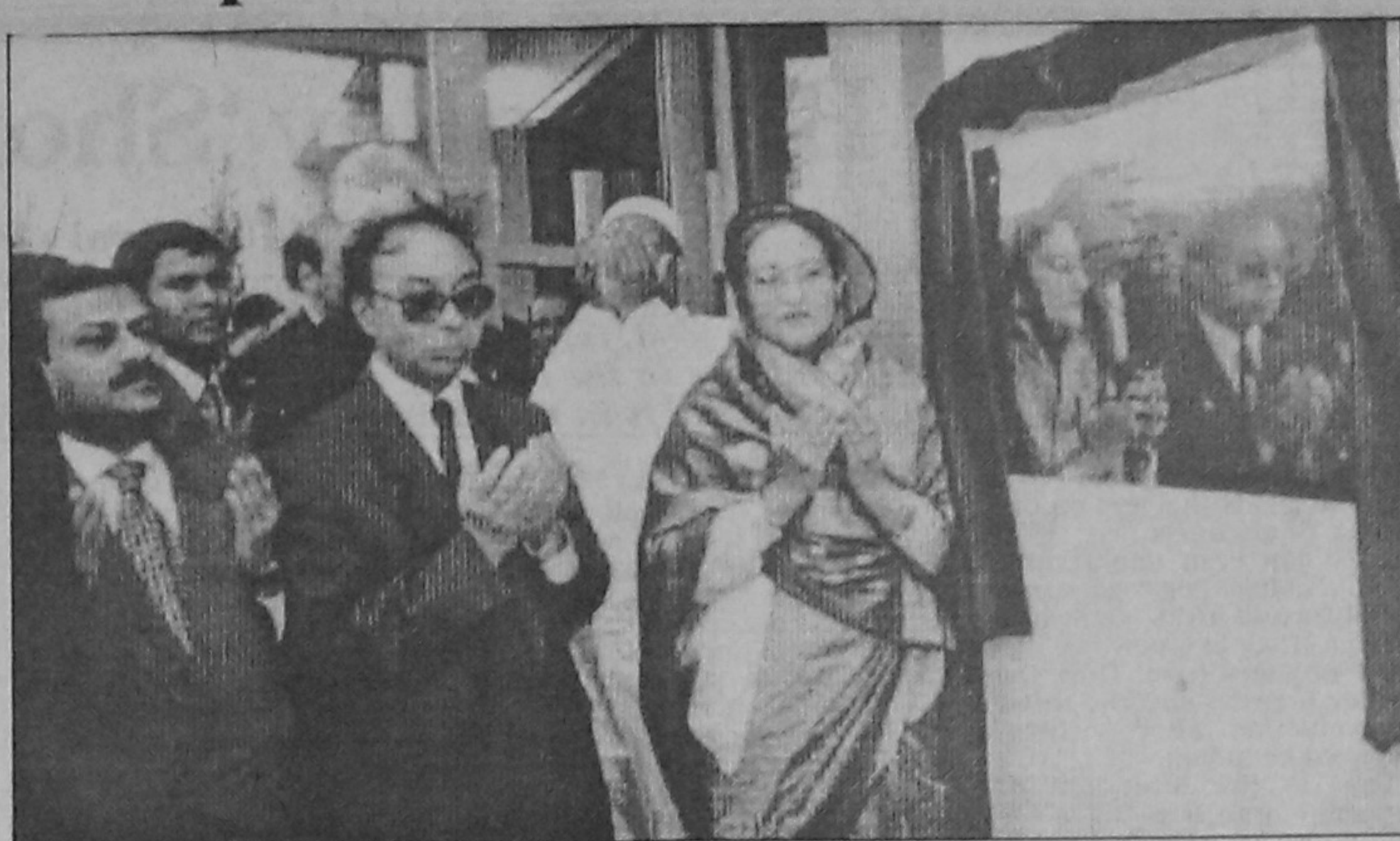
Prime Minister Sheikh Hasina is offering Munajat after inaugurating the Bangladesh Chancery Building in Washington, DC on Sunday.