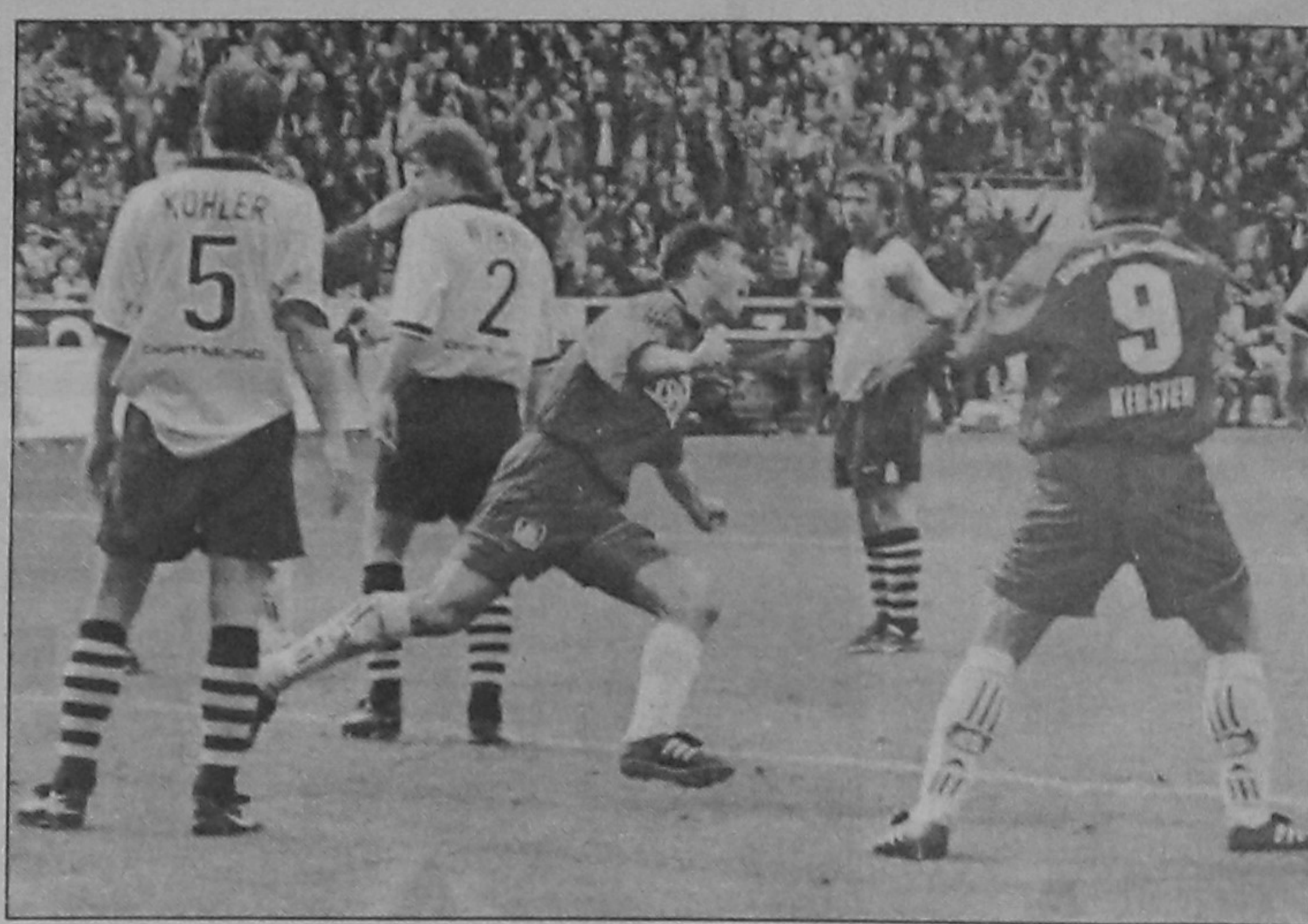
Bayer Leverkusen's Paulo Rink (C) celebrates his second strike against Borussia Dortmund during their Bundesliga clash at Leverkusen on April 8.