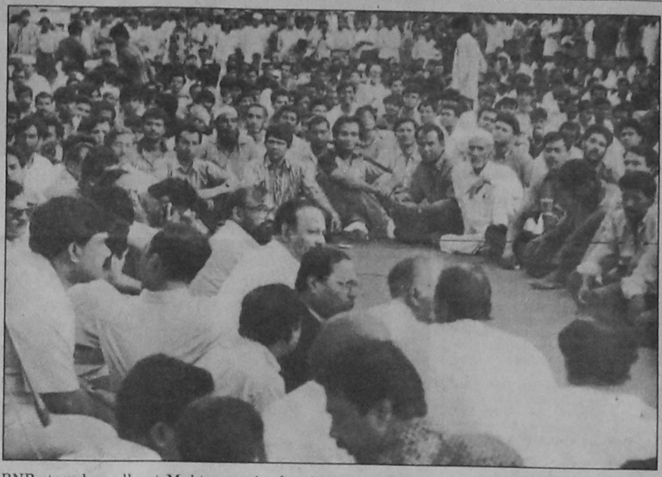
BNP staged a rally at Muktaganj in the city yesterday.