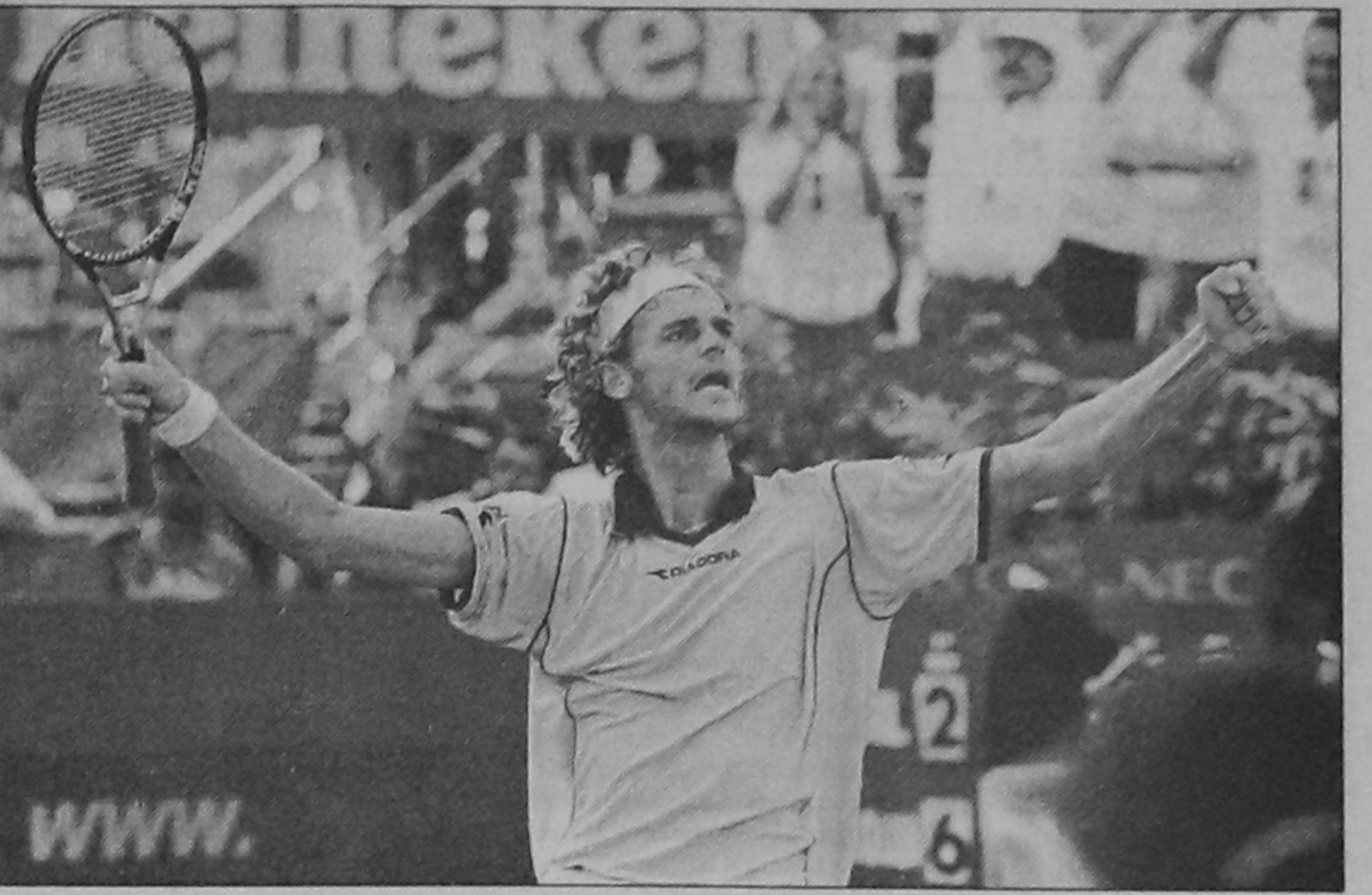
Brazilian star Gustavo Kuerten is ecstatic after beating Slovak Karol Kucera during their Davis Cup quarterfinal in Rio de Janeiro on April 7.

Leaders Bayer Leverkusen entertain Borussia Dortmund today. Defending champions Bayern Munich, second two points back, host SSV Ulm.