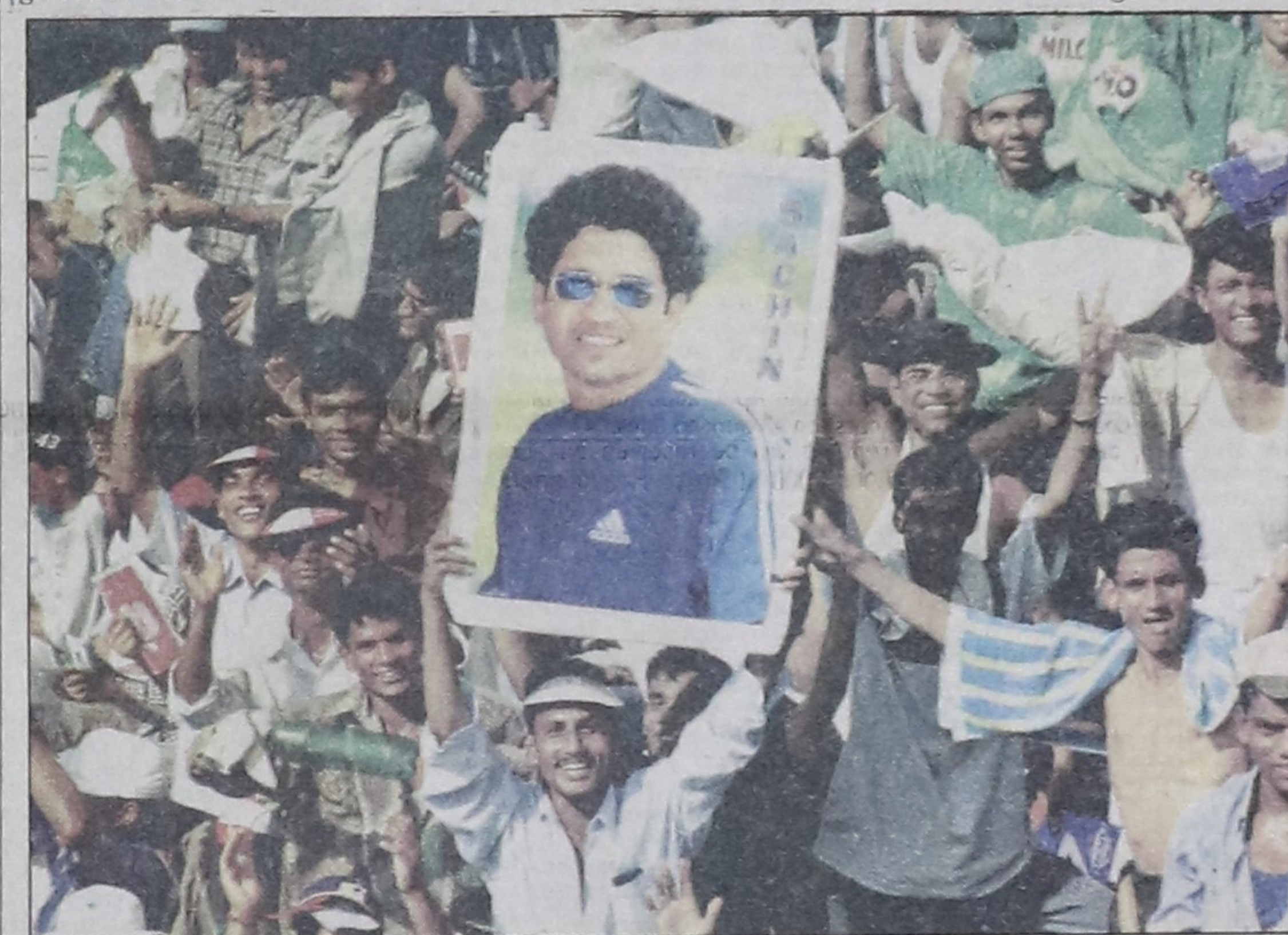
TENDULKAR CORNER? A section of the huge crowd at the Bangabandhu Stadium yesterday.