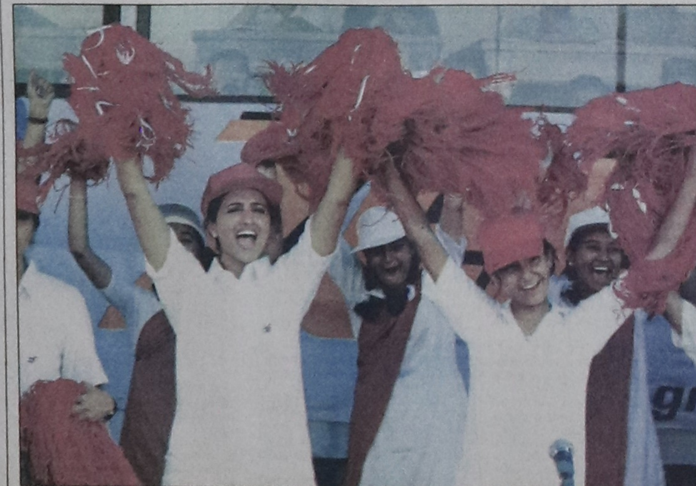
Cheer girls, who have been flown in to add colours to the Asia XI vs Rest of the World XI mega-match, at work at the Bangabandhu National Stadium yesterday.

"We have not got our top players, but they are going to join us later," Miandad said. "If they come, obviously we will have a good chance and I have full confidence in my team that they can take anything."