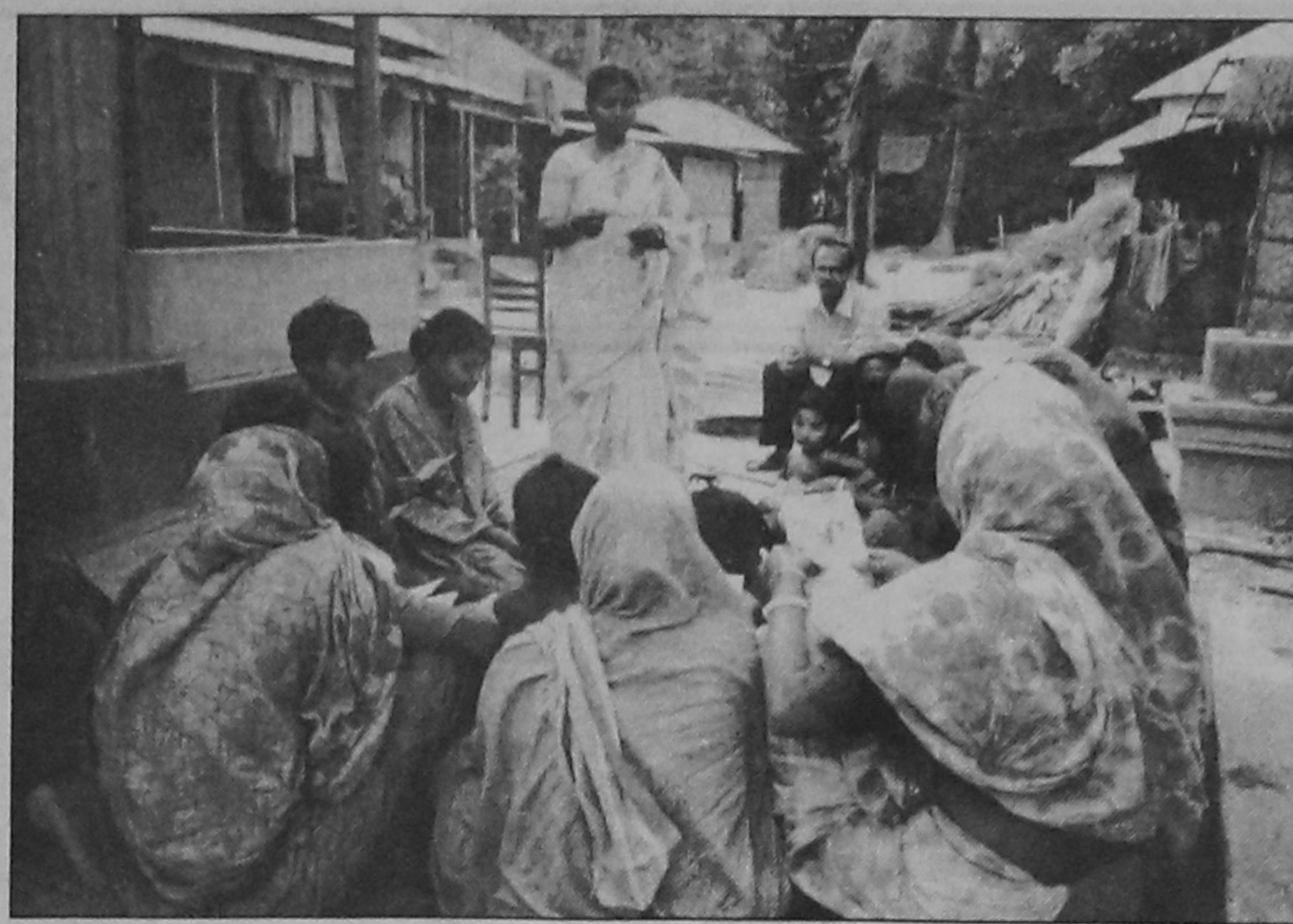
Rotary International has taken up an arsenic mitigation project in Manikganj thana in collaboration with UNICEF. Four Rotary clubs have donated US $50,000 and UNICEF US $34,000 for the project which involves community members (seen above) in choosing implementing and maintaining alternate sources of safe drinking water.