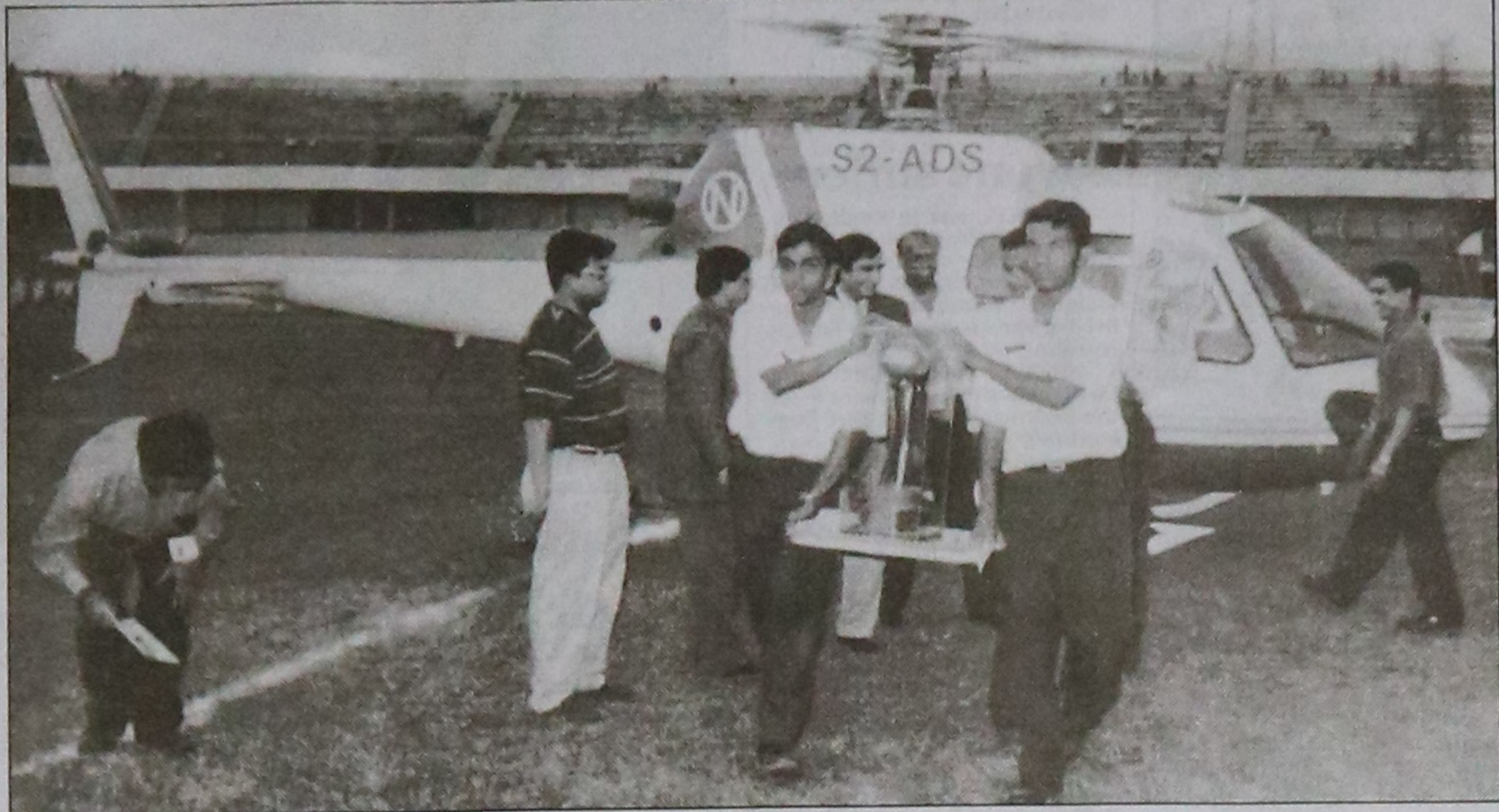
NO CHEERS FOR CHOPPER: The sponsors of the National Football League Nitel-Tata arranged a stunning event by bringing in the champions' trophy in a chopper. However there were less than a handful present at the stadium to appreciate this 'first of its kind' innovation.