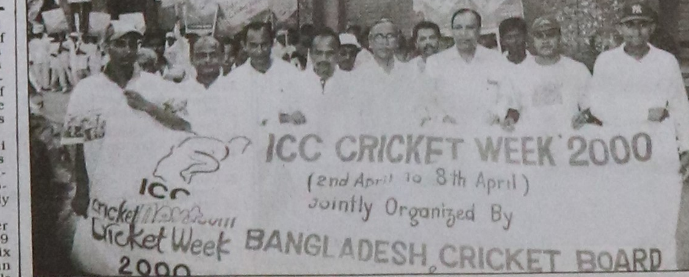
On the occasion of Cricket Week a procession was brought out in Barisal on April 2.