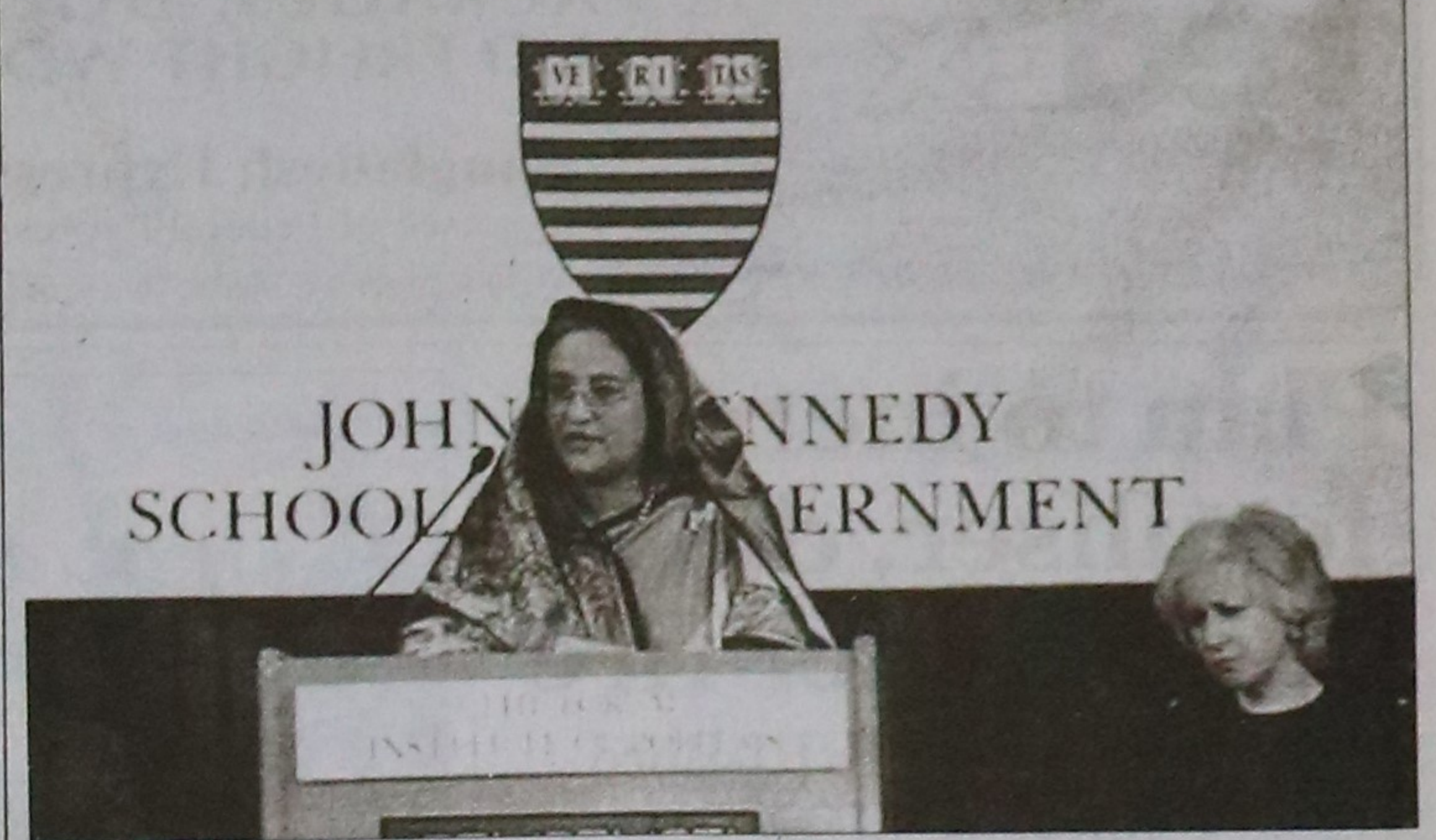
Prime Minister Sheikh Hasina addressing the ARCO Forum at John Kennedy School of Government at Harvard University at Boston on Wednesday.