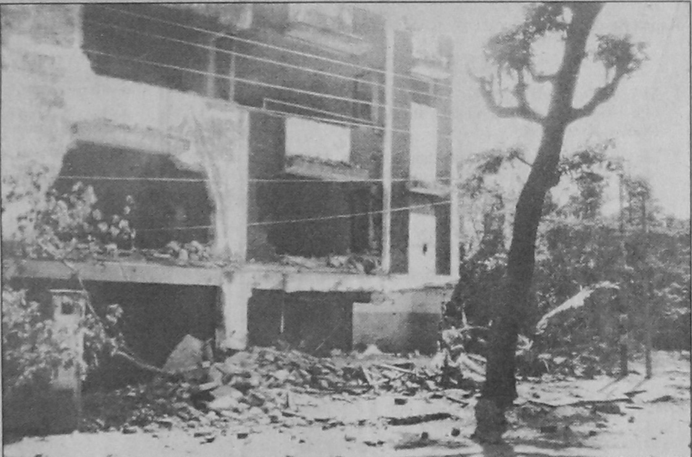
The house of former chief engineer of PWD at Road 32, Dhanmondi was bulldozed yesterday.