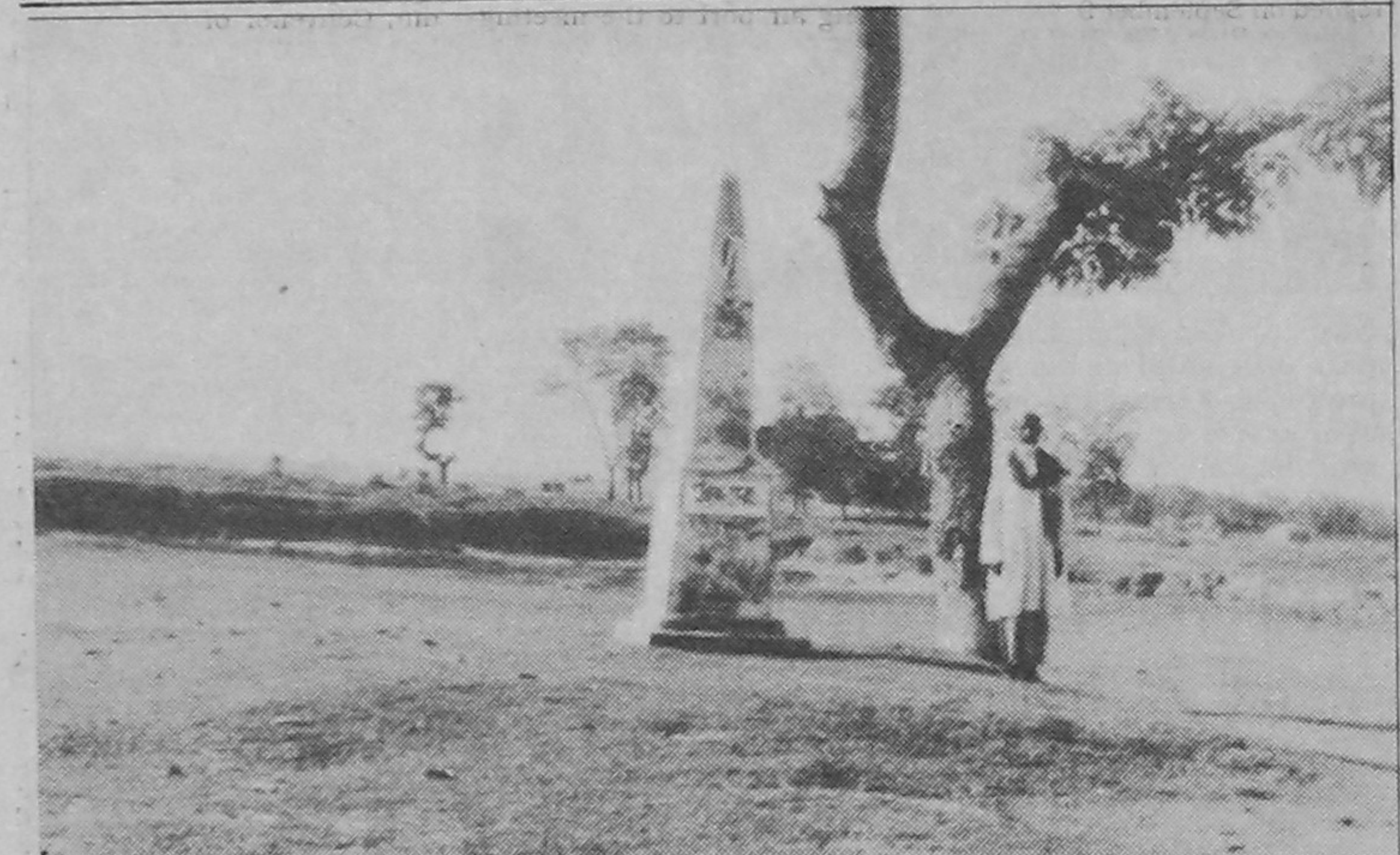
Rangpur villagers' patriotism

Under this system, farmers from the traditional tribal community particularly slash, dries and burn forest vegetation, then plant crops or pastures, using the ashes as manure to enrich — but only temporarily — the nutrient poor soil, the Conservator of Forests of Rangamati Forests Circle, Altaf Hussain Khan told when asked for his comment on the impact of Jhooming in CHTs.