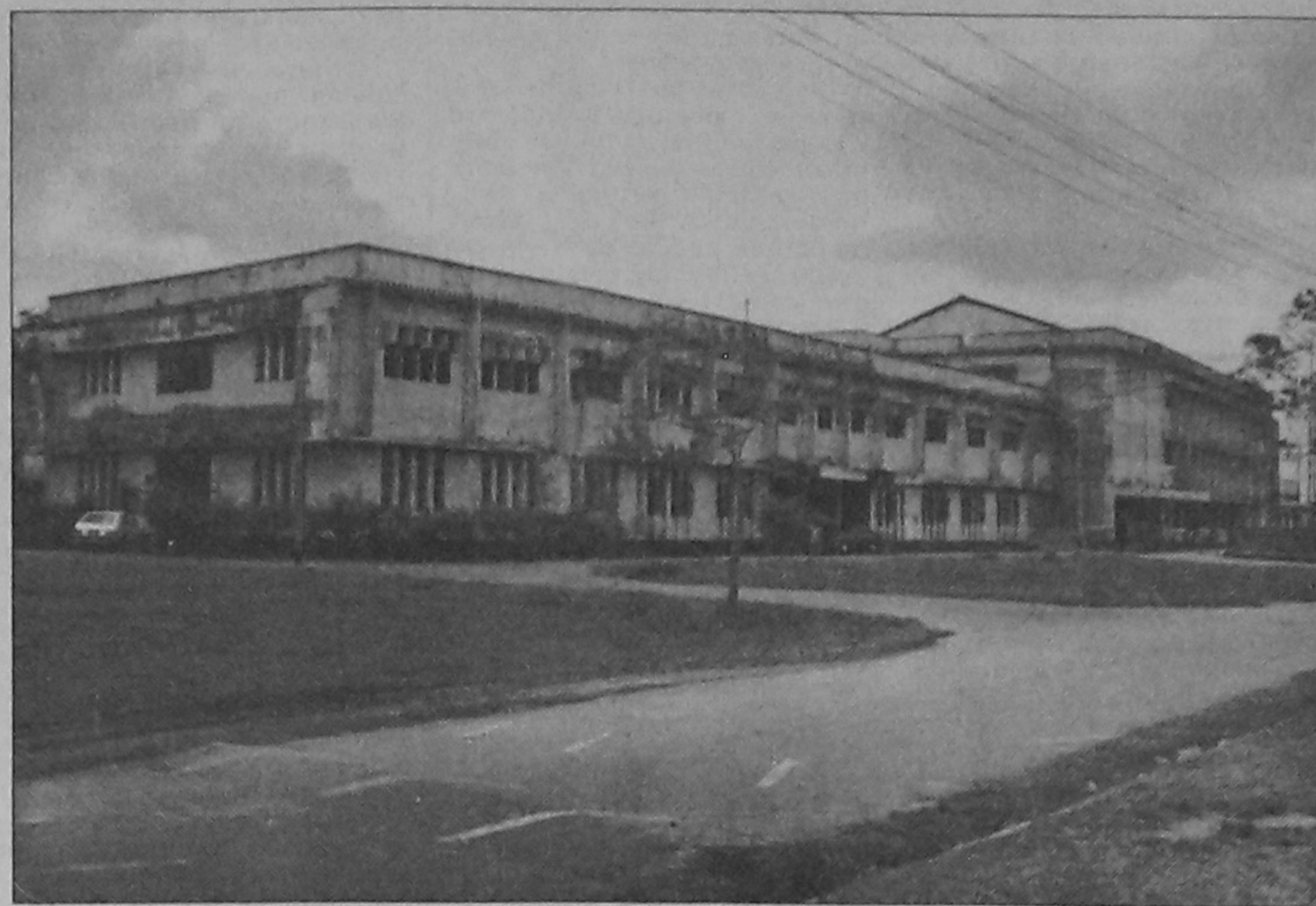
The Administrative Building of Sher-e-Bangla Medical College in Barisal.

BARISAL, Apr 4: The 500-bed Barisal Sher-e-Bangla Medical College and Hospital is now plagued with manifold problems.