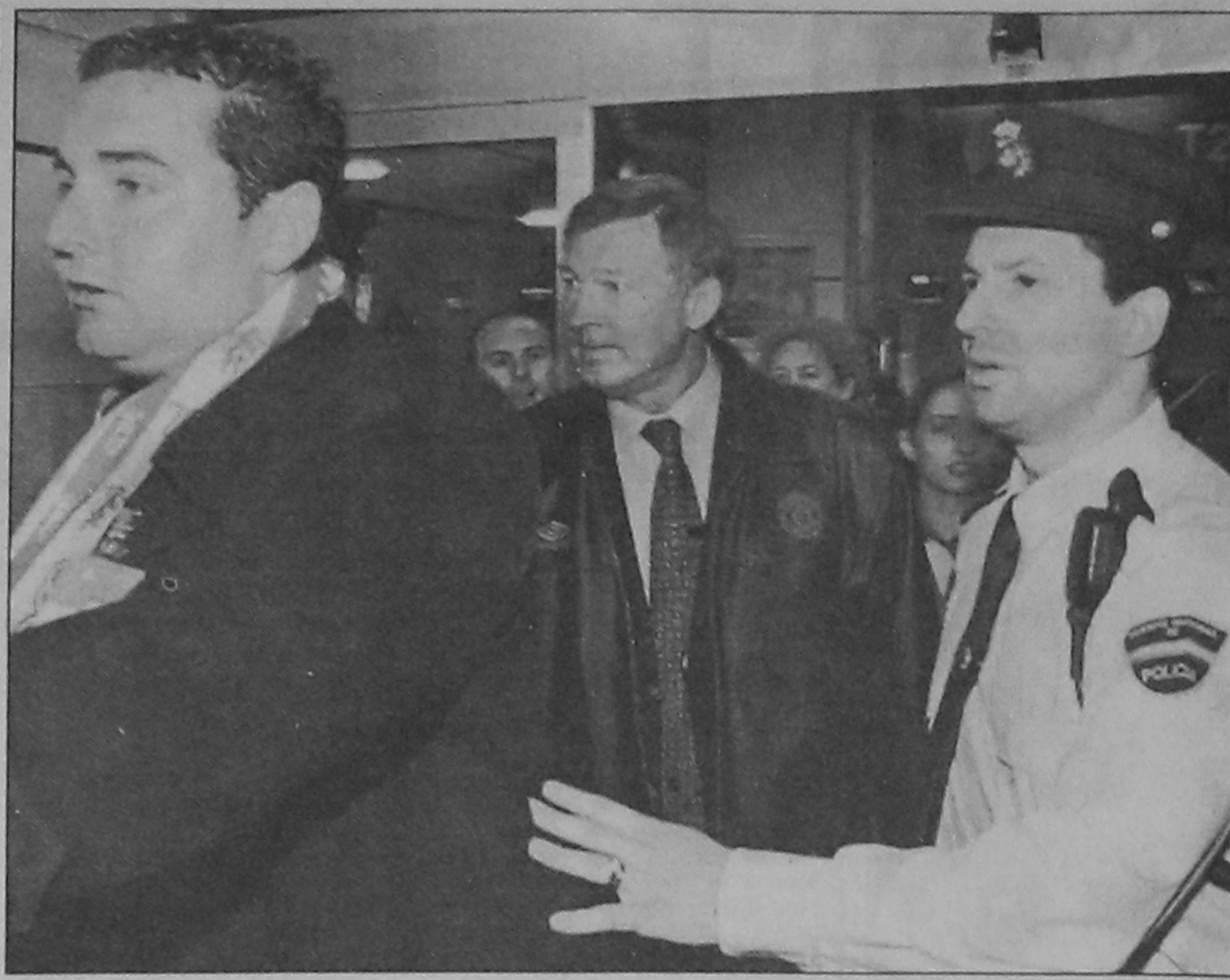
Manchester United manager Sir Alex Ferguson(C) arrives at Madrid's Barajas Airport yesterday. United take on Real Madrid in a crucial Champions League quarterfinal first leg at the Santiago Bernabeu Stadium today.