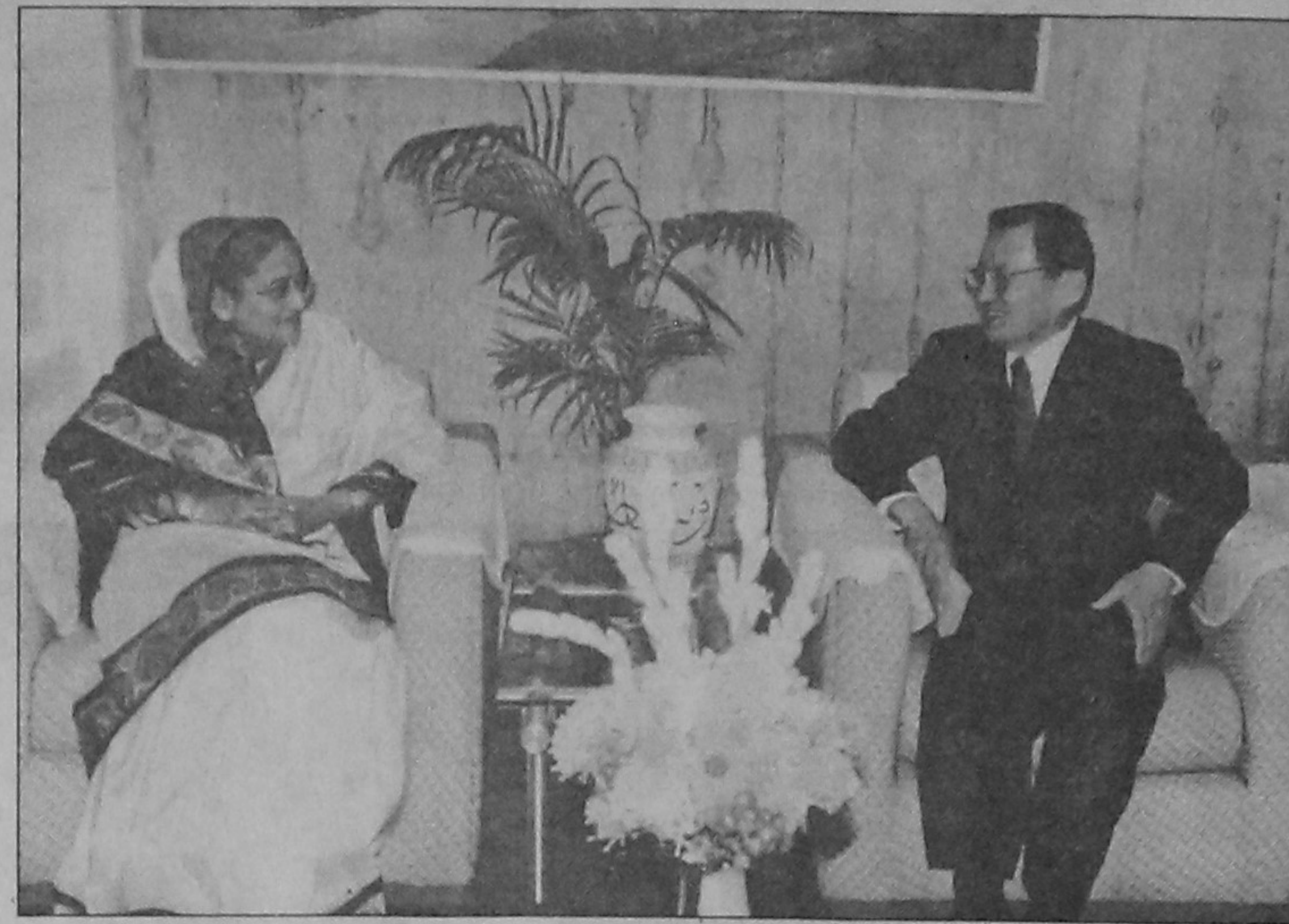
Asian Development Bank president Tadao Chino (right) called on Prime Minister Sheikh Hasina at her Parliament office yesterday.