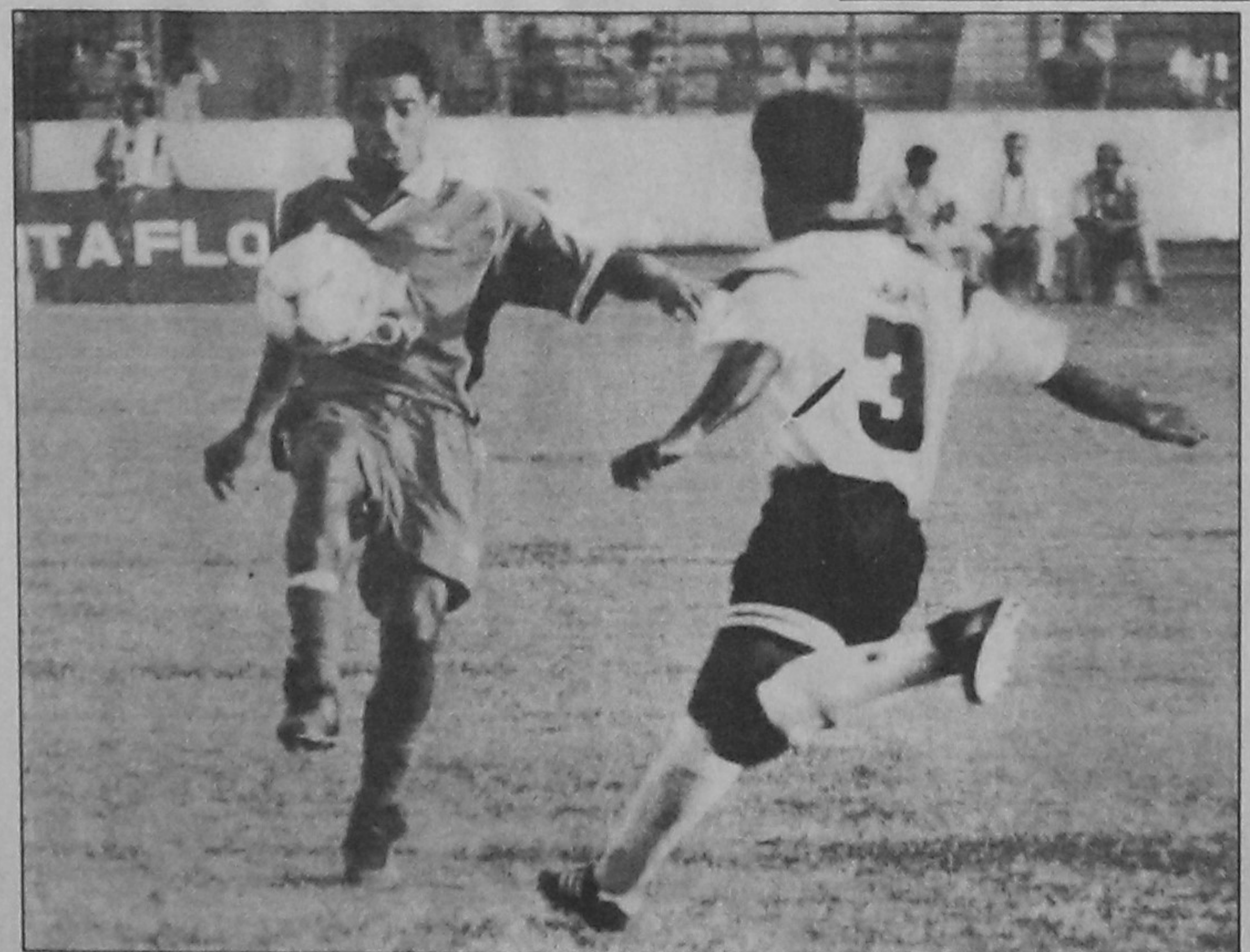
Muktijodha Sangsad's Brazilian recruit Bereto(L) trying to take control of the ball during a Nitol-Tata National Football League fixture at Mirpur yesterday.

Carlisle brought up the Zimbabwe's 50 off 30. See page 15