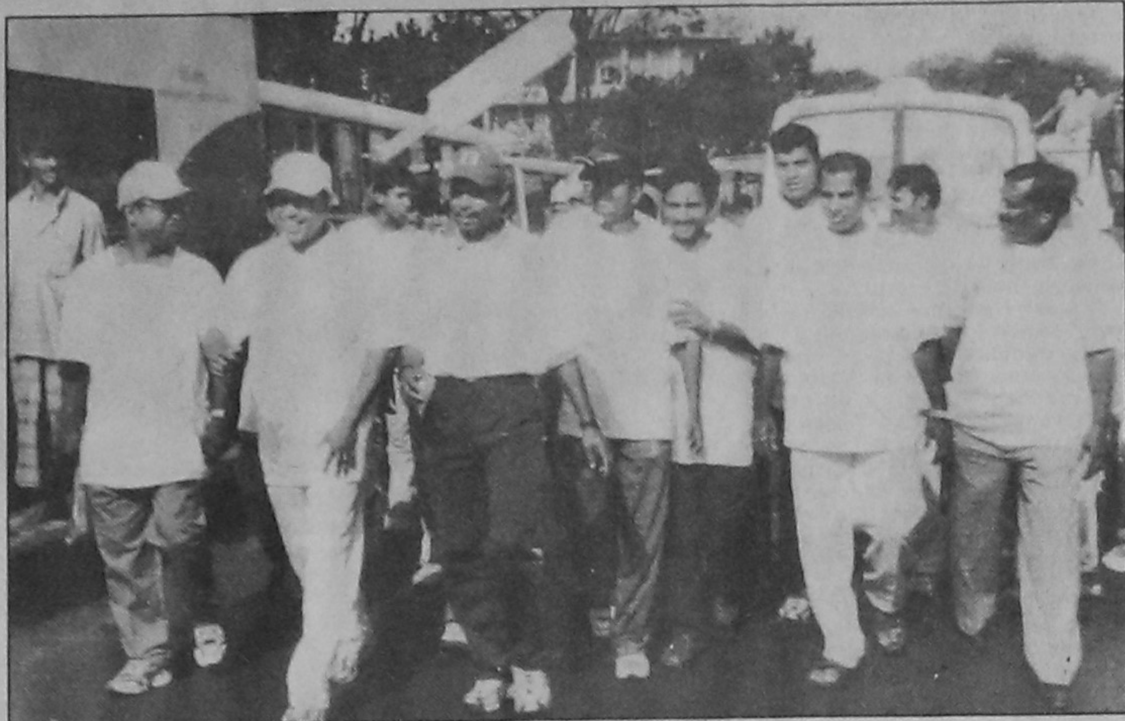
Present and former national cricketers joining the rally which kicked off the International Cricket Council's 'Cricket Week' festivities in the city yesterday.

The BCF will provide food and accommodation to all participants from districts.