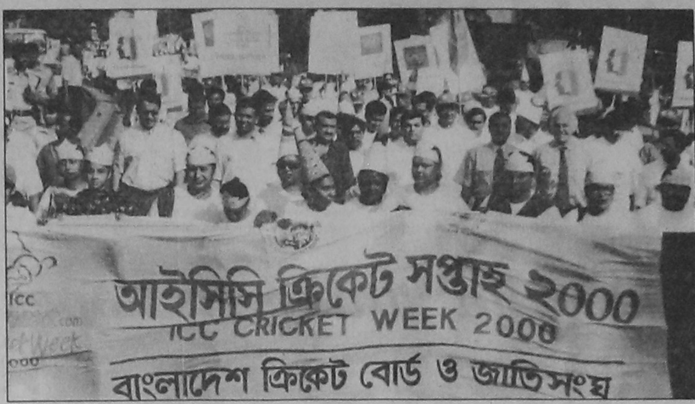
Bangladesh Cricket Board and United Nations brought out a colourful rally in the city yesterday commemorating ICC Cricket Week-2000.

A rickshawpuller, aged about 45, died instantly as a bus crushed his three-wheeler at Mouchak crossing at about 8 pm yesterday, reports UNB. Witnesses said the bus, running from Sayedabad to Kalkaor in Gazipur district, also hit two other rickshaws. But none was injured. Traffic movement over the busy crossing was disrupted for about 15 minutes before police rushed to the spot and recovered the body lying on the street. Police held the killer bus. But the driver and the helpers managed to escape the scene soon after the accident. Replying to a supplementary