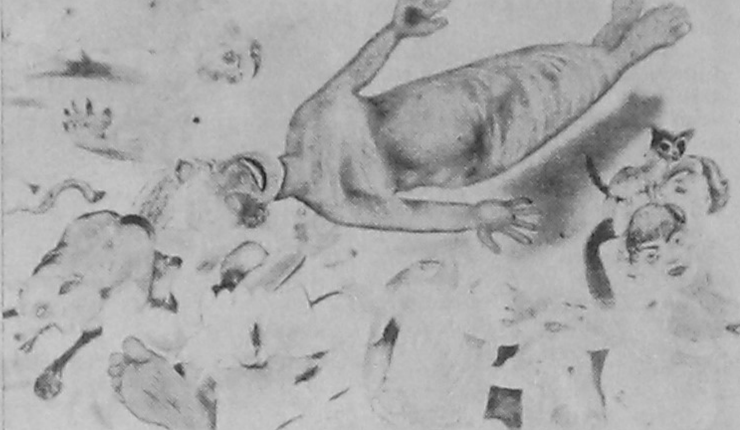
Come and see the game - 8, 1995

This exhibition will be open to all till April 10 from 10 am to 8 pm.