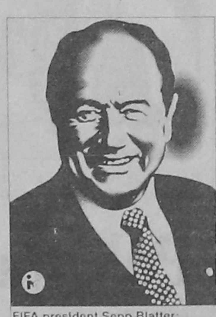
FIFA president Sepp Blatter. Backs Africa

Rival bids for the 2006 tournament have been submitted by