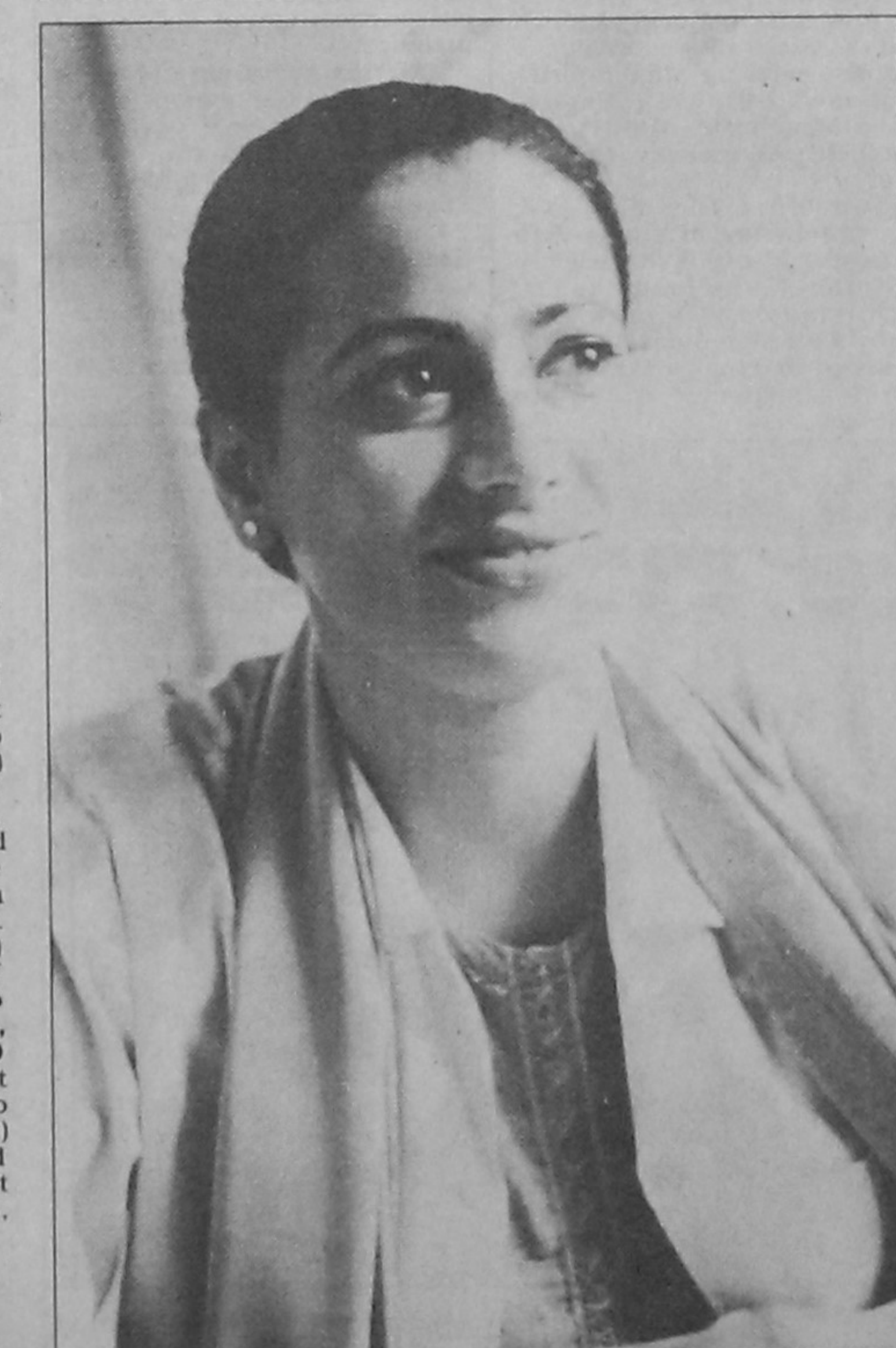
Star Bestseller 'Abhay' on Star Plus at 10.00pm

8:30 Khabrain 8:45 Mansoobajaat Barai Khud Kafalat 9:00 Sur Savaria & Sehra Ka Safar & Sada-E-Kasmi 9:40 Shana Ba Shana 9:50 Aaj Ki Kitaab-Aik Nazm 10:05 Boor Kay Ladoo 10:30 English Film Chip And Dale 10:55 Milli Naghma 11:00 Khabrain 11:10 Serial 11:35 Serial- 12:00 Urdu Khail 12:55 Quran-E-Hakeem 1:02 Bismillah, 1:15 Drama Serial- 2:00 Serial- 2:50 The Earth Revealed 3:20 Aarshi Puday 3:40 Natural World 4:35 How Things Work 5:00 Yeh Mumk In Hae 5:25 Hamara Sehat 5:55 Kitab Quiz 6:25 Aoi Courses 7:00 Tarun 7:05 Felix The Cat 7:30 Such Gup 7:45 English News 8:00 Morven Gold Raceway 8:25 Gigot 8:55 Ptv Gold 9:00 Break For Headline News 9:20