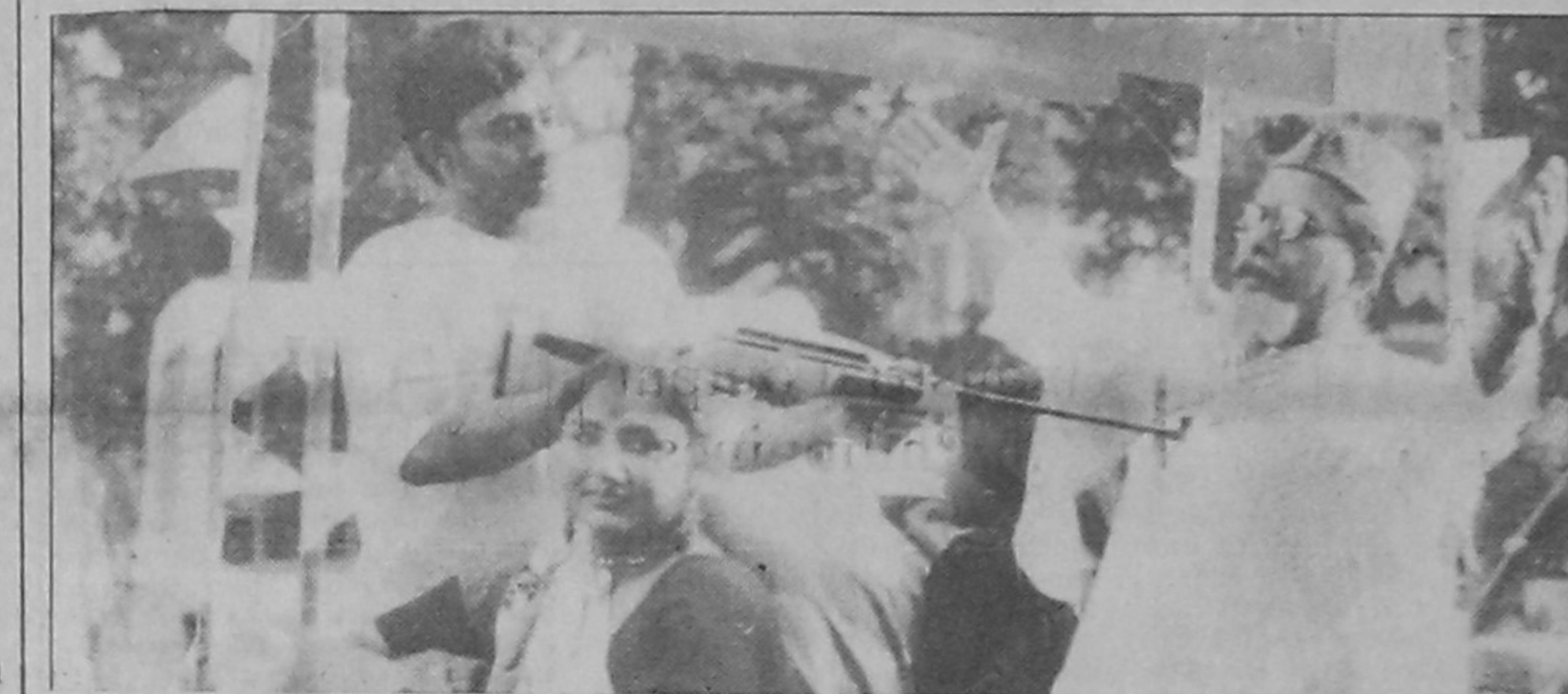
On the occasion of 'Bishwa Natya Dibash' Bangladesh Group Theatre Federation I T I Bangladesh brought out a colourful rally in the city