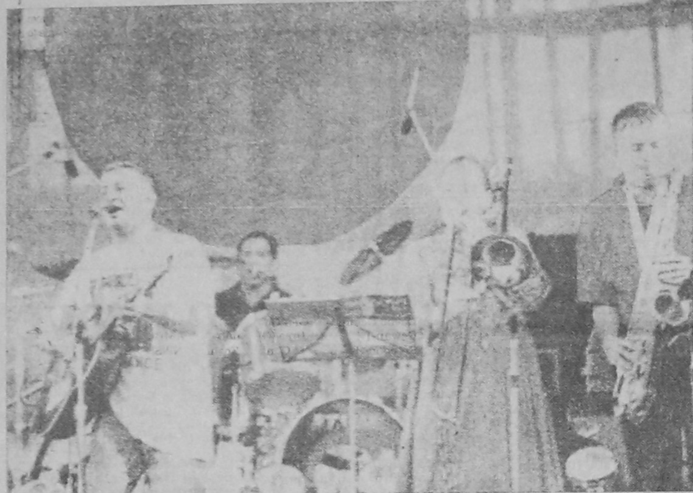
Renaissance performs at the Shadhinota Concert 2000.

'Bhuli Nai Re...' a song on Shadhinota was sung which made the audience stunned. With a great feel and inner voice James sang the song, which brought out the true essence of it. One minute silence honouring the martyrs was observed by everyone present at the concert. Nagar Baul performed quite a number of their chartbusters like, 'Lila Bai' and 'Taray Taray', which along with the exclusive fireworks were very much liked by all. In all, the concert fulfilled all the desires of the audience who will remember it for along time to come.