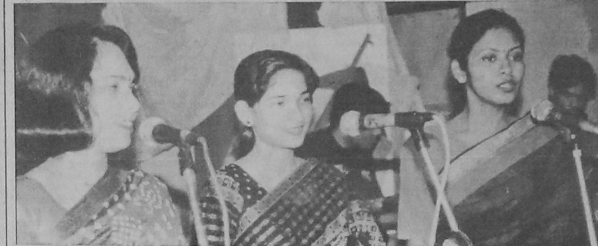
Students of North South University (NSU) are rending patriotic songs at a cultural programme organised by NSU cultural club 'Shangskritik Shangothon' to mark the Independence Day 2000 on March 23 at NSU Campus.