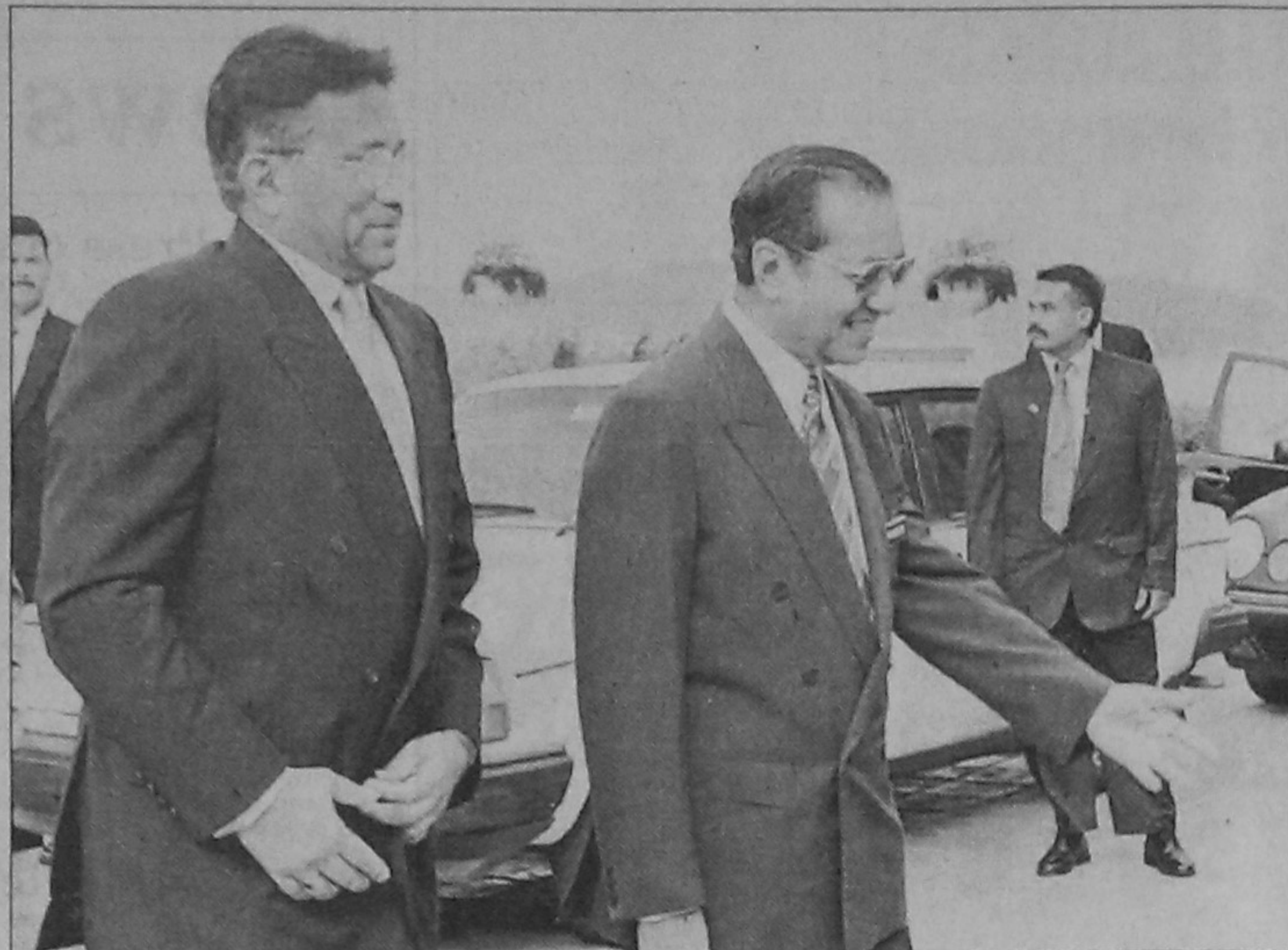
Malaysian Prime Minister Mahathir Mohamad (R) escorts Pakistan military ruler General Pervez Musharraf upon his arrival at the Prime Minister's department in Putrajaya yesterday. Musharraf is in Malaysia on a three-day official visit.

Torkham sits smack on the border with Afghanistan, ravaged by a bitter and bloody civil war.