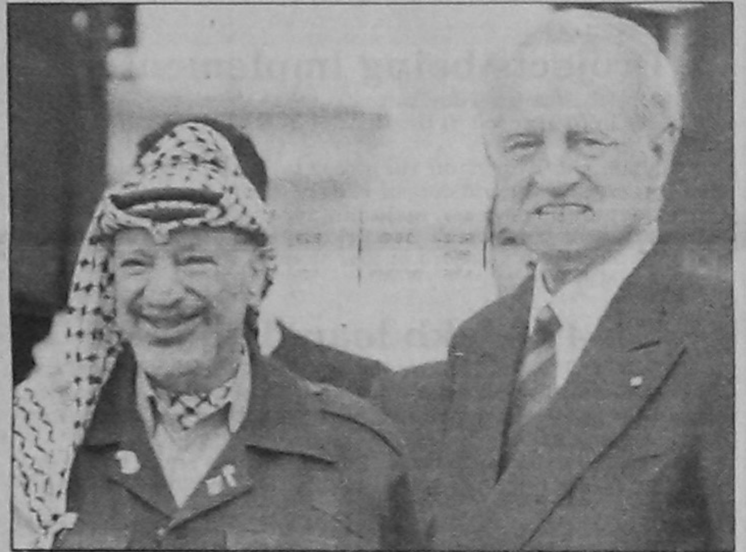
German President Johannes Rau (R) and Palestinian leader Yasser Arafat pose for photographers in Berlin on Monday. Arafat is currently on a four-day visit to Germany.