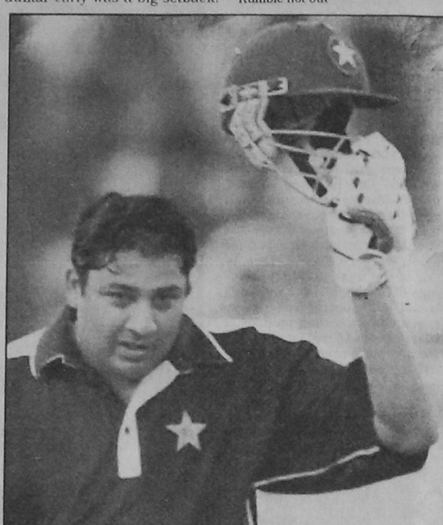
Man-of-the-match Inzamamul Haq raises his helmet after his magnificent century against India at Sharjah on March 26.

We depend on these two for a good start, but when they go early the rest of the batting becomes unsettled."