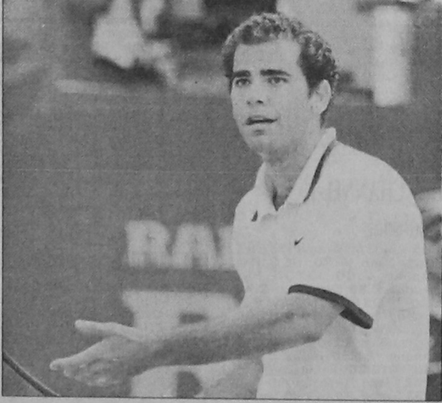
American Pete Sampras disputes a line call during his match against Andreas Vinciguerra of Sweden at Ericsson Open in Key Biscayne on March 26.

Third seed Yevgeny Kafelnikov of Russia had an easier time, advancing 6-4, 6-3 over Brazil's Fernando Meligeni.