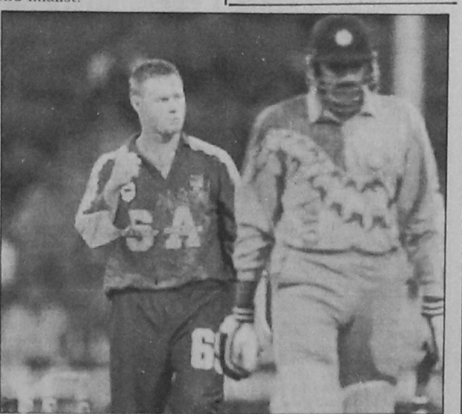
South Africa's Lance Klusener (L) is euphoric after seeing the back of Anil Kumble during yesterday's Sharjah Cup match against India.

Rajon took the only wicket of Shetu giving away 37 runs in 10 overs.