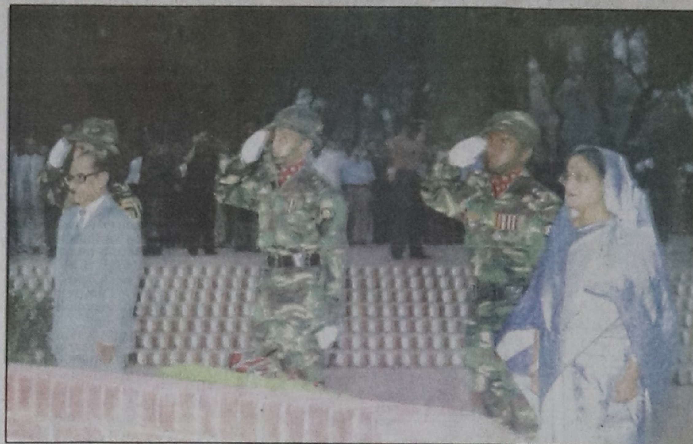
President Shahabuddin Ahmed and Prime Minister Sheikh Hasina pay homage to the martyrs of the Liberation War at the National Mausoleum in Savar on the Independence Day.